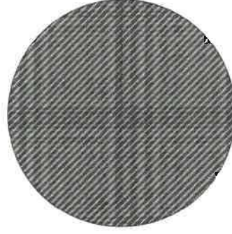
Local Government Investment Pool 100.00%