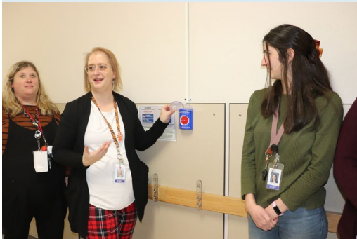
Oceanlake Elementary School staff receiving training on how to use the school's new Blue Button Safety System.