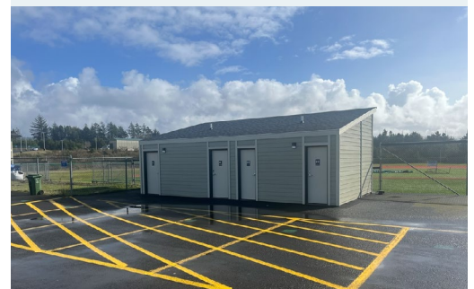
New baseball and softball restrooms at Waldport Middle/High School are complete!