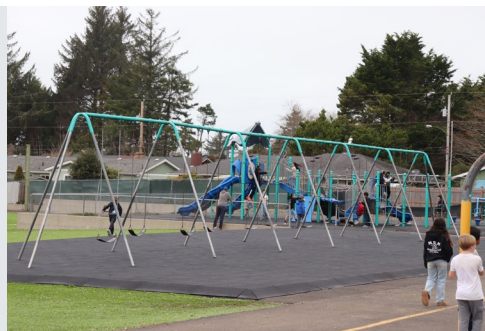
The new fall protection at Sam Case Elementary is complete.