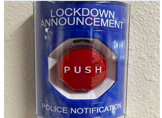
The 2025 Bond has funded the installation of Blue Button Safety Systems district-wide.