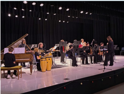
Taft High School students using the newly updated theater!