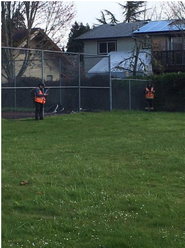
Archaeologists from AINW perform a pedestrian survey of the Lincoln site