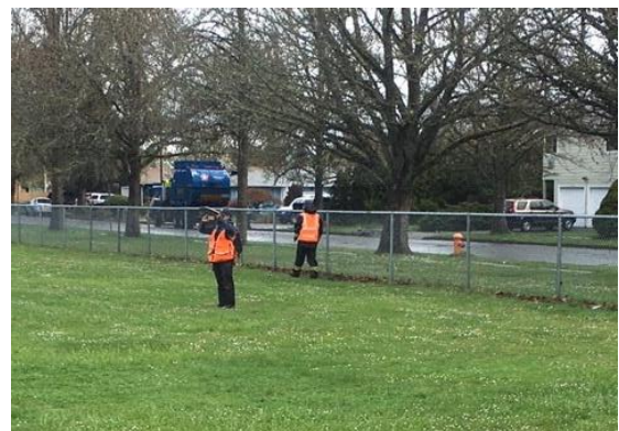
Archaeologists from AINW perform a pedestrian survey of the Garfield site