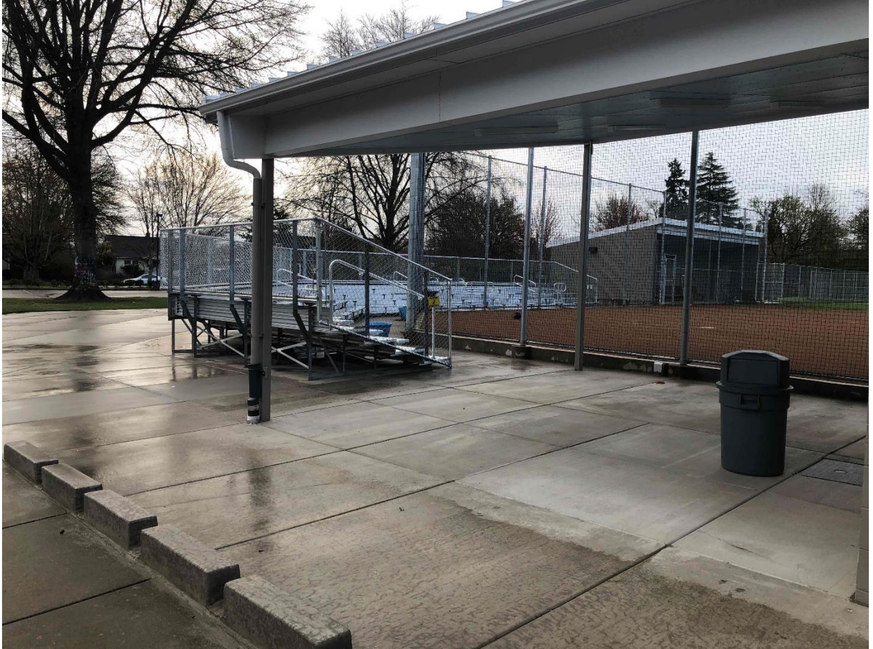
Ceilings complete at dugouts – ready for players!