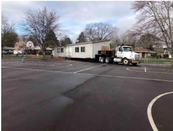
Garfield Modular Classrooms are moved in place