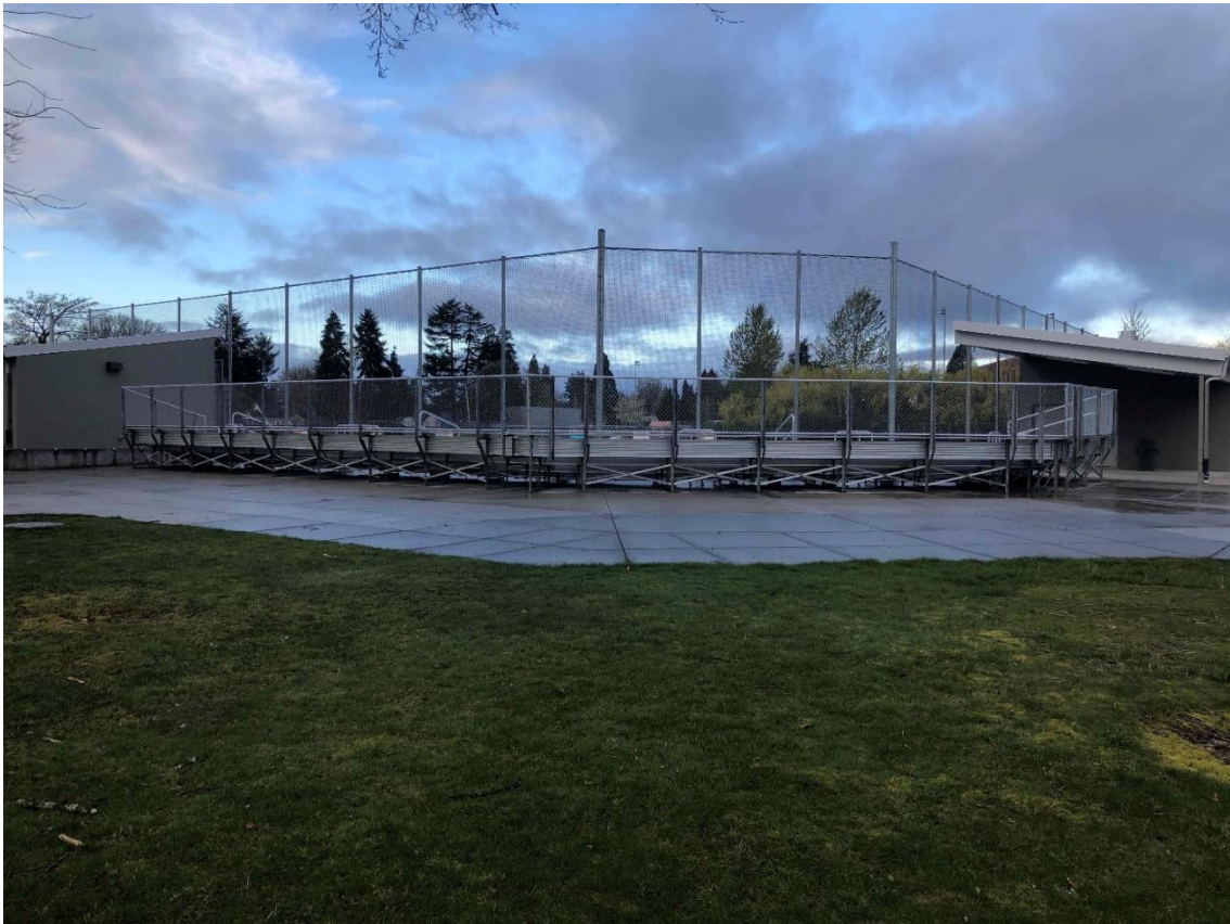
New bleachers installed at the softball field