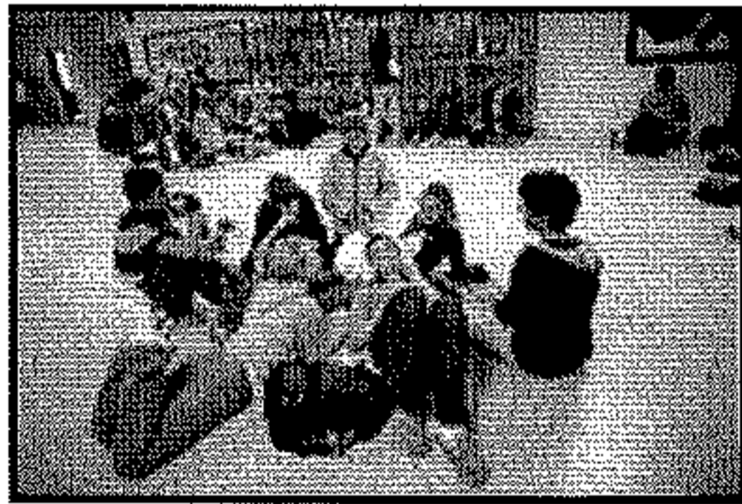
Lunch at Thomas Jefferson High School in suburban Washington, D.C.

There are more than 18,000 public high schools in the United States. What if you could take a snapshot of each one and capture, at a particular moment, what kinds of students were enrolled there and the caliber of the education provided them? If you were to collect these individual snapshots into one huge national yearbook, which high school would be chosen as "Most Likely to Succeed," meaning that it set the best example of how to prepare students to achieve their post-graduation goals?