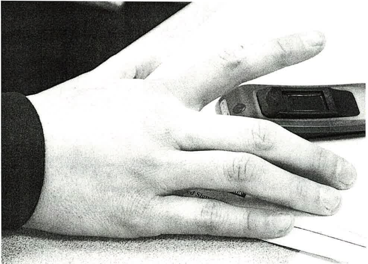
TIME TO EAT — A staff member at Fairmont Elementary School is seen getting an index finger scanned as part of the new biometric finger ID system used in the lunch room at the school.

FAIRMONT — Fairmont Elementary School recently began using a new system to get children through the lunch line in less time and with more security.