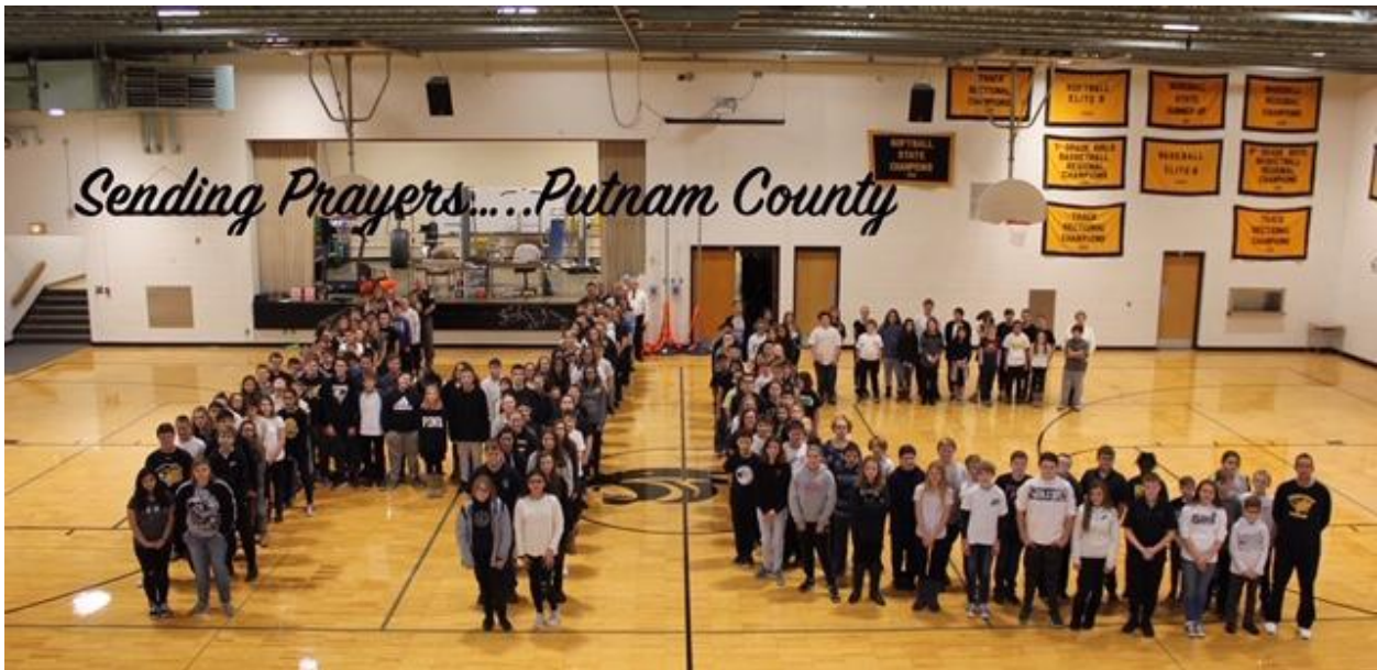
PCJH Sending our thoughts and prayers to the Holy Cross team for the loss of their student.