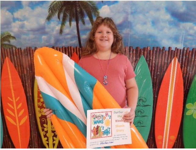
SHANIA STORY – 2 nd Grade