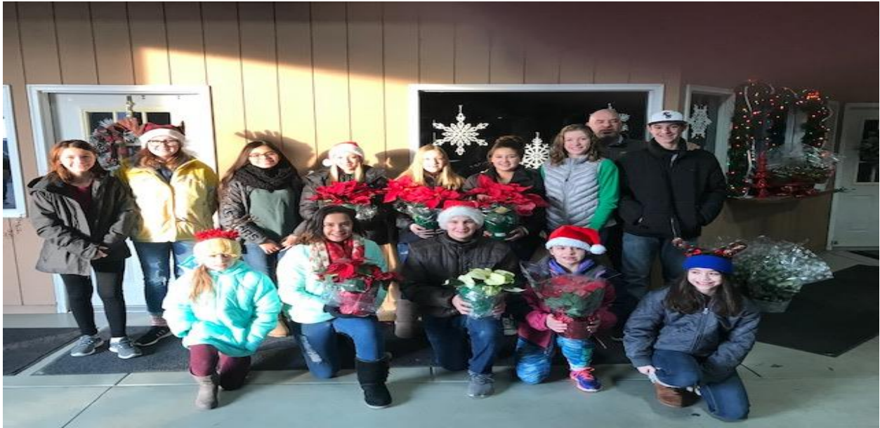
PCJH Interact members assisting the PC Rotary for their annual Poinsettia holiday deliveries.

Thank you for a great first semester and have a wonderful holiday!