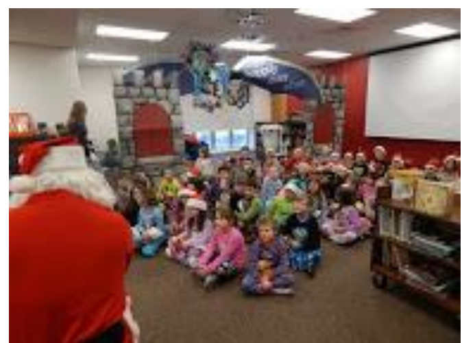
Santa Reading to 2 nd Grade