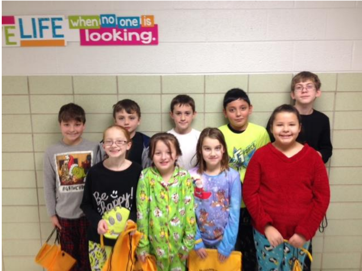
PCES December Students of the Month