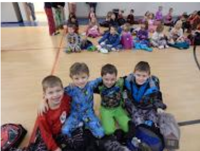
We're Excited About Pajama Day!