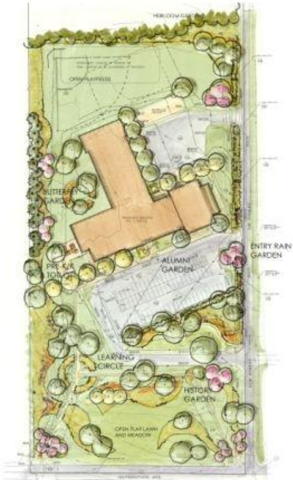
CONCEPTUAL LANDSCAPE MASTER PLAN - PRE-K THRU SECOND GRADE SCHOOL PUTNAM COUNTY COMMUNITY SCHOOL DISTRICT 535 GRANVILLE, PUTNAM COUNTY, ILLINOIS