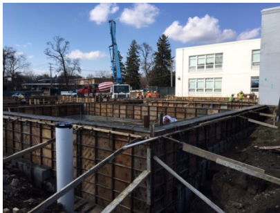
Half Day – Poured walls at Southeast