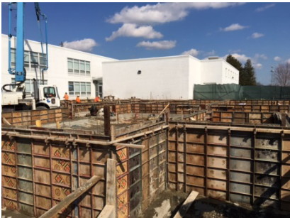
Half Day – Poured walls at Southwest