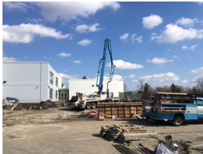
Half Day – Foundation Pour at Center