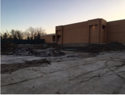
Sprague – Excavation & Utility Work