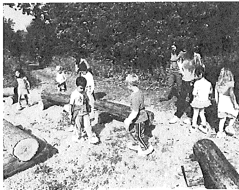
Kindergartners from Sprague School visit Rivershire Nature Center Friday morning in Lincolnshire.