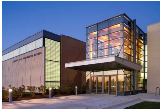
Andover YMCA Community Center