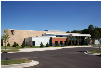
Chain of Lakes YMCA