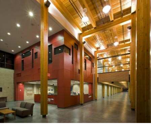
Andover YMCA Community Center