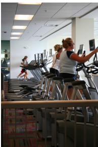
Chain of Lakes YMCA