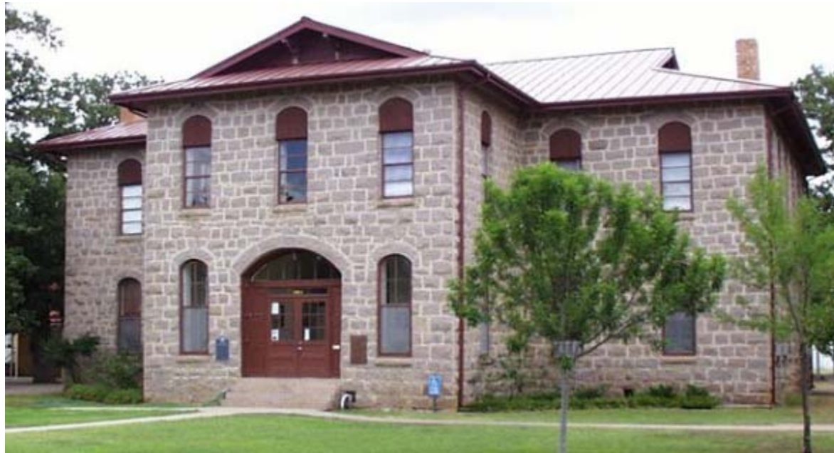
Granite School House 1891