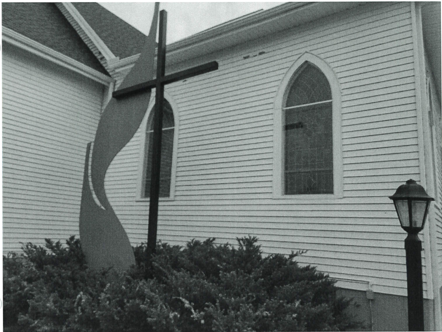
Front - SE alcove