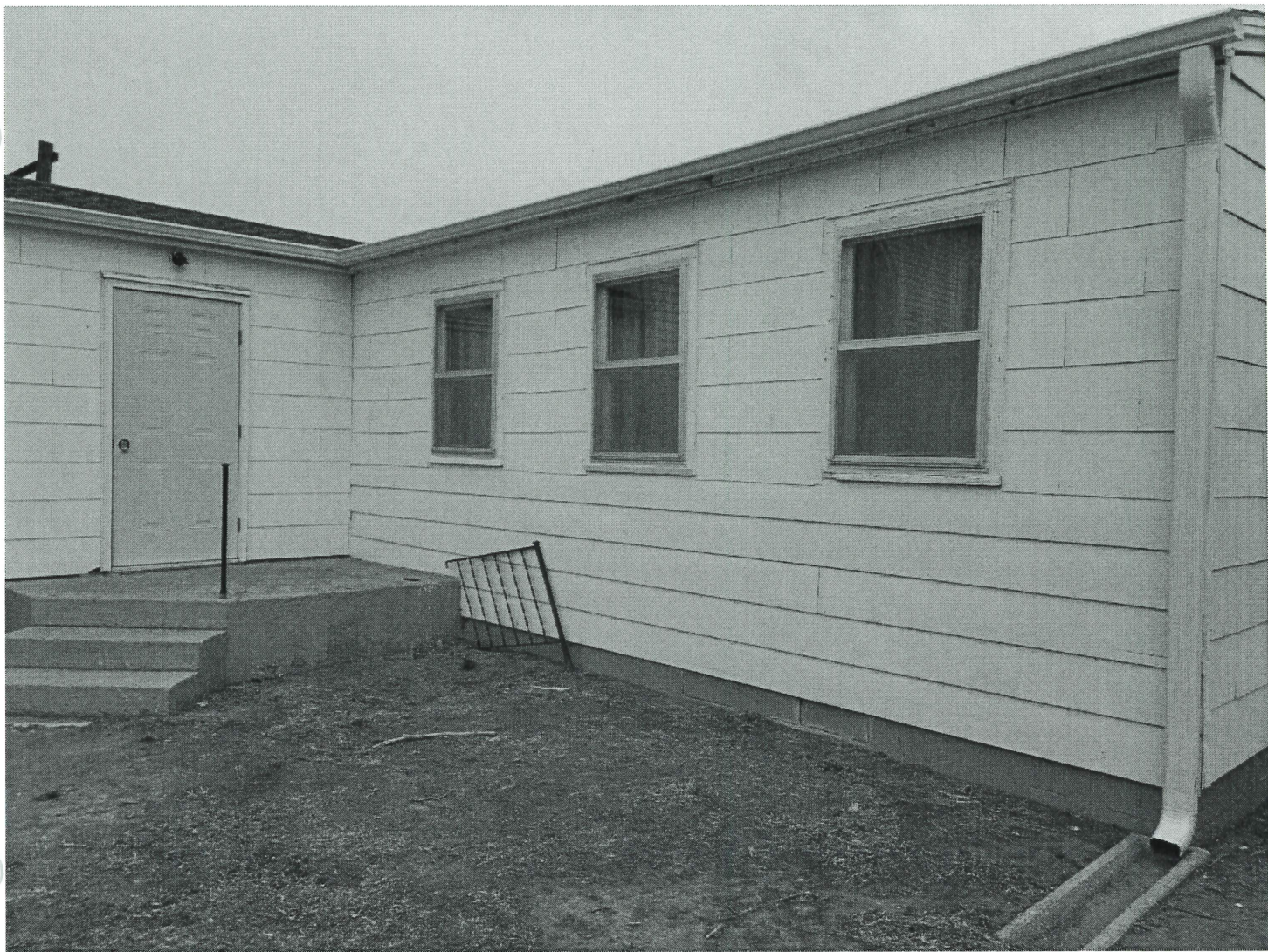
N + E side - of Ed. Wing on East side of Sanctuary