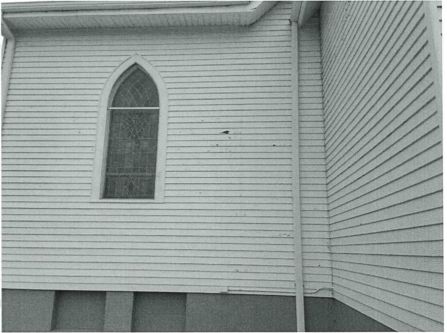
Front - S. W alcove