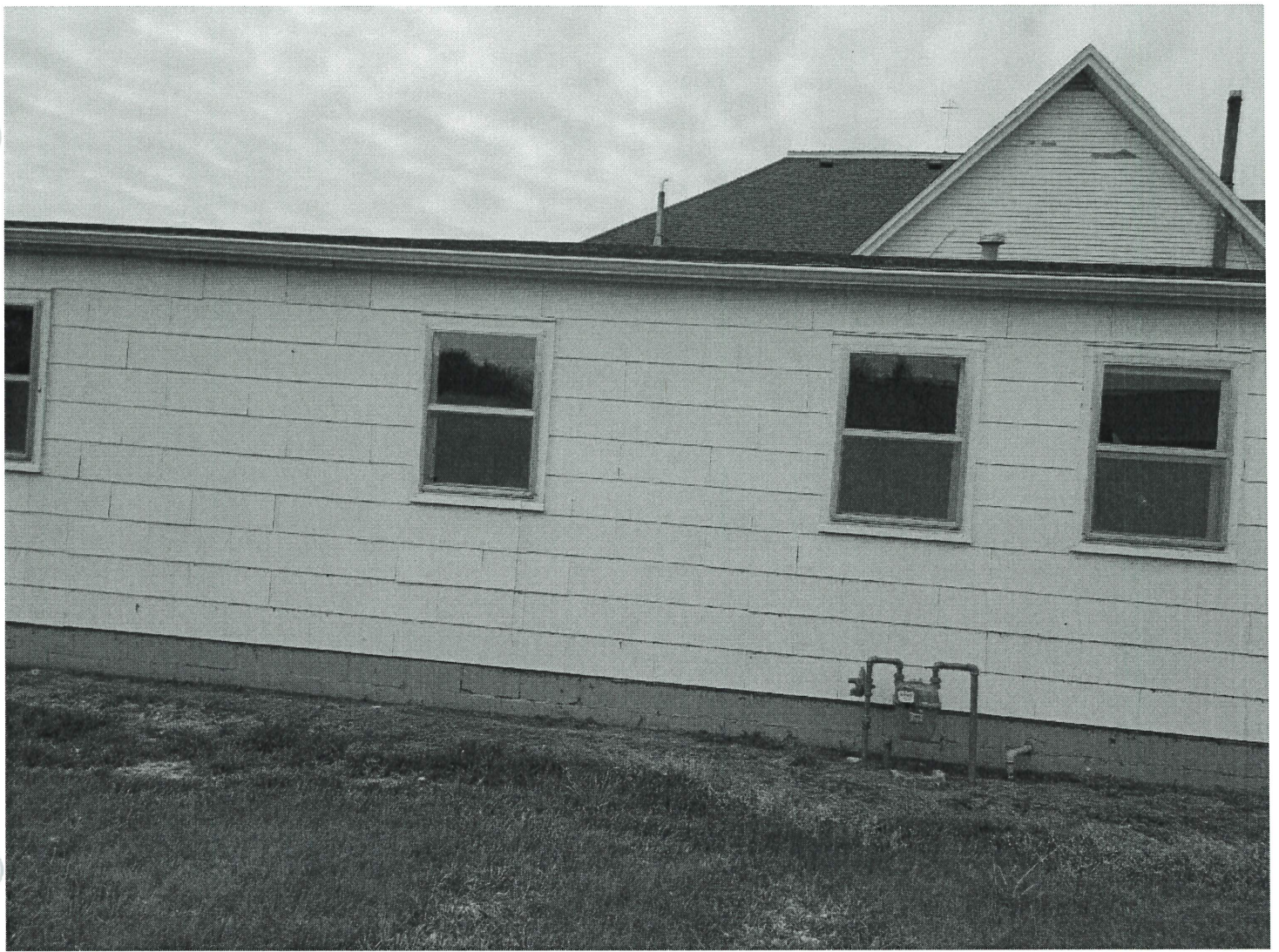
Nside Ed wing