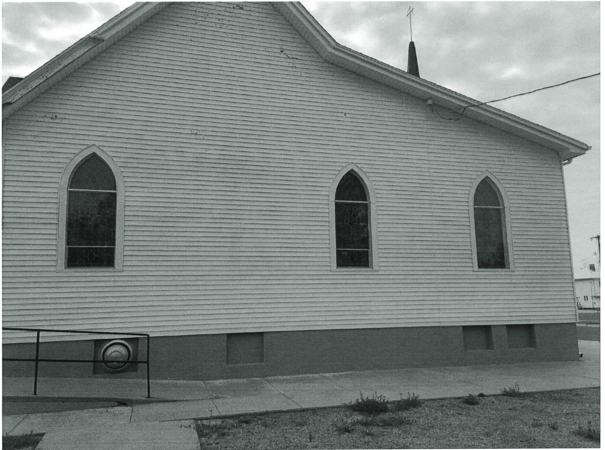
W side Sanctuary