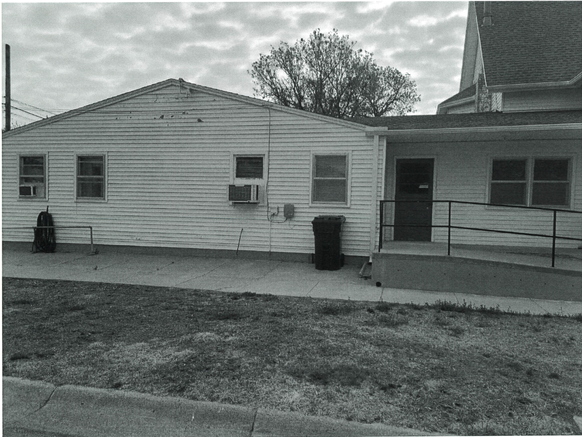
W side Ed wing + offices