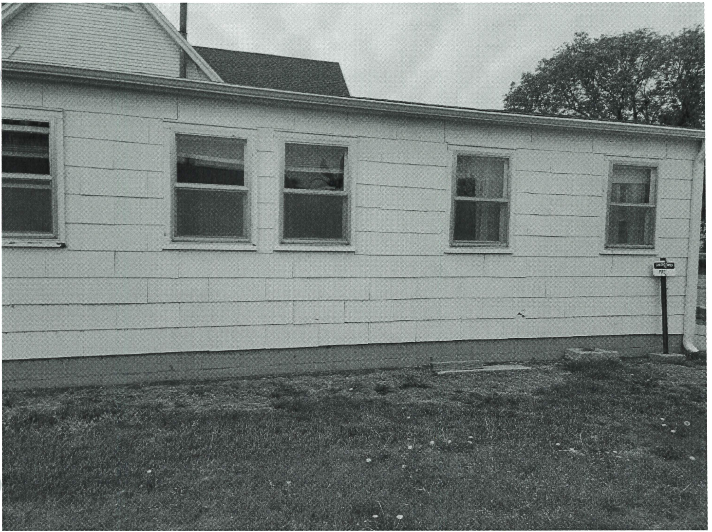
N side Ed wing