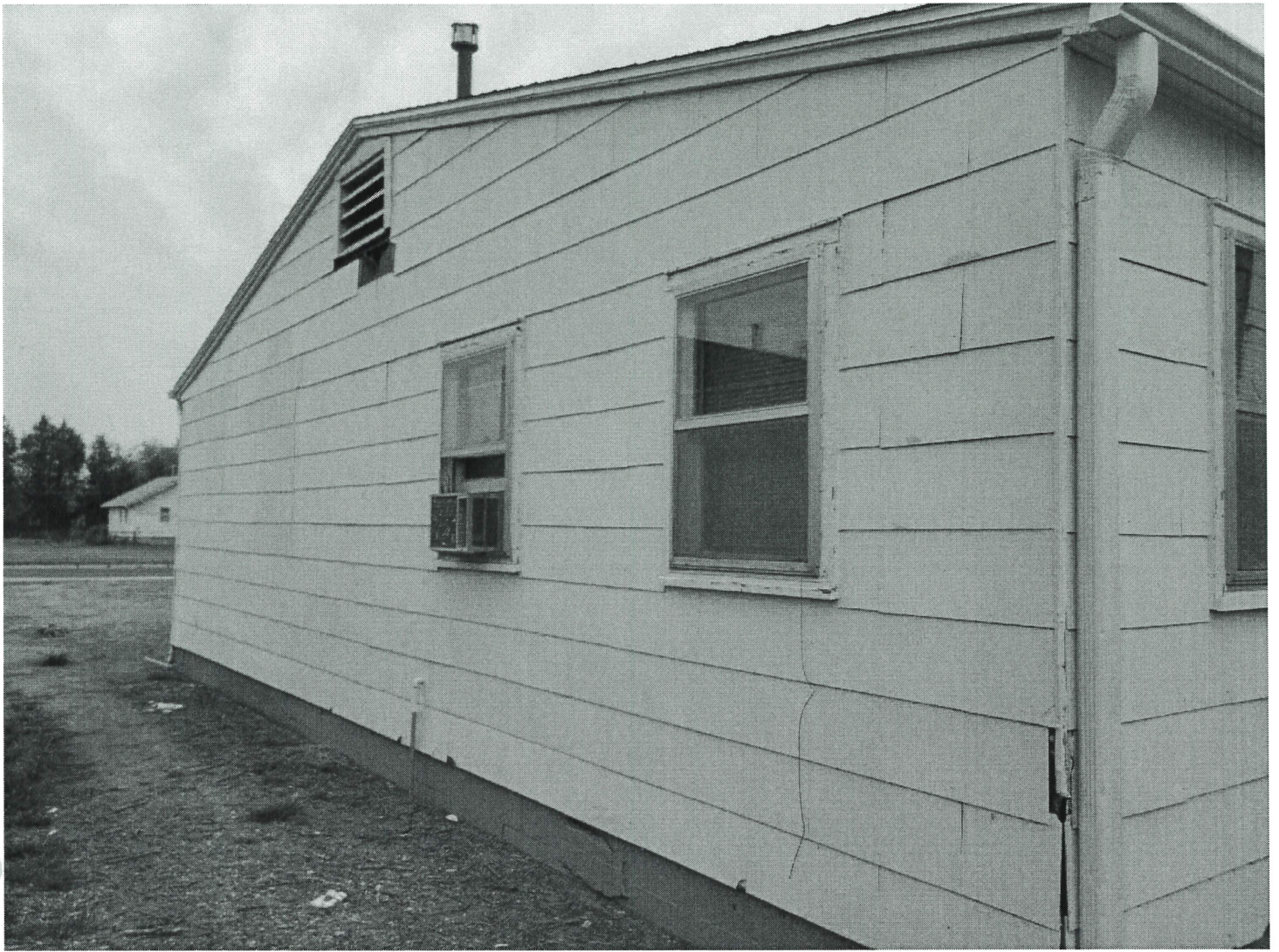
E end est. wing