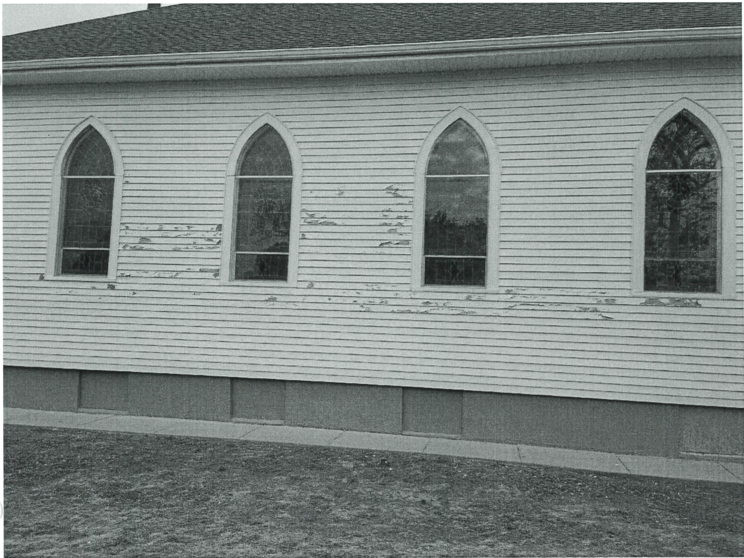
East side sanctuary