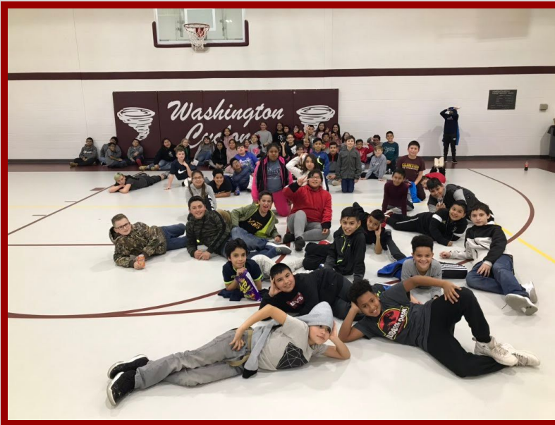
Washington students attending AR Celebrations.