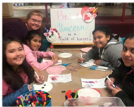
Pictured below: Students at the art station in our Makerspace. Every classroom spends time in our Makerspace creating, exploring, playing, designing, and strengthening their ability to think and solve problems once a week. (CSI 2.1.1 Makerspace as an extension of the classroom)