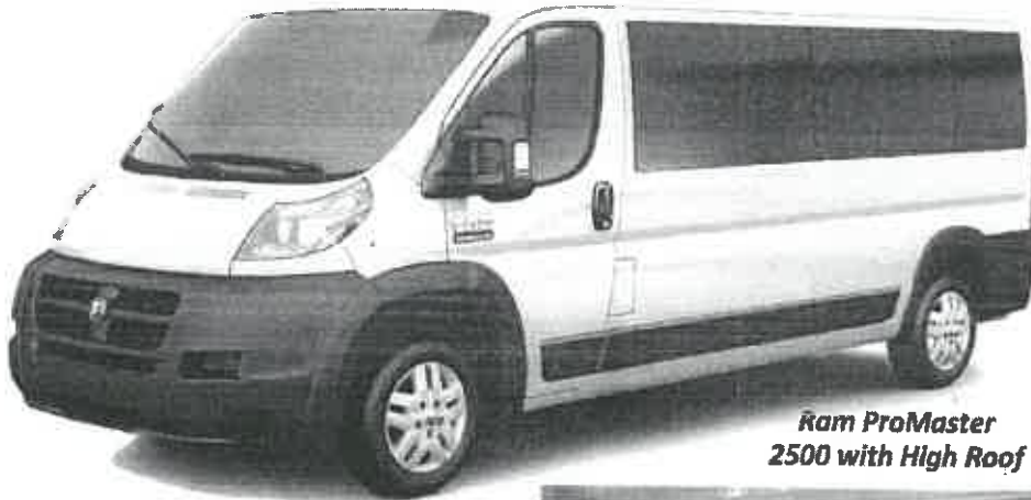
Ram ProMaster 2500 with High Roof