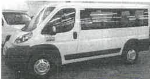
Ram ProMaster 1500 with Standard Roof and Full Custom Window package