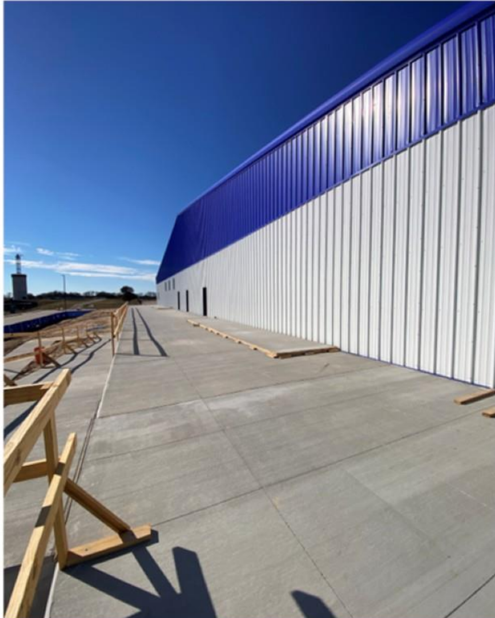
Metal Building and ADA Ramp Access