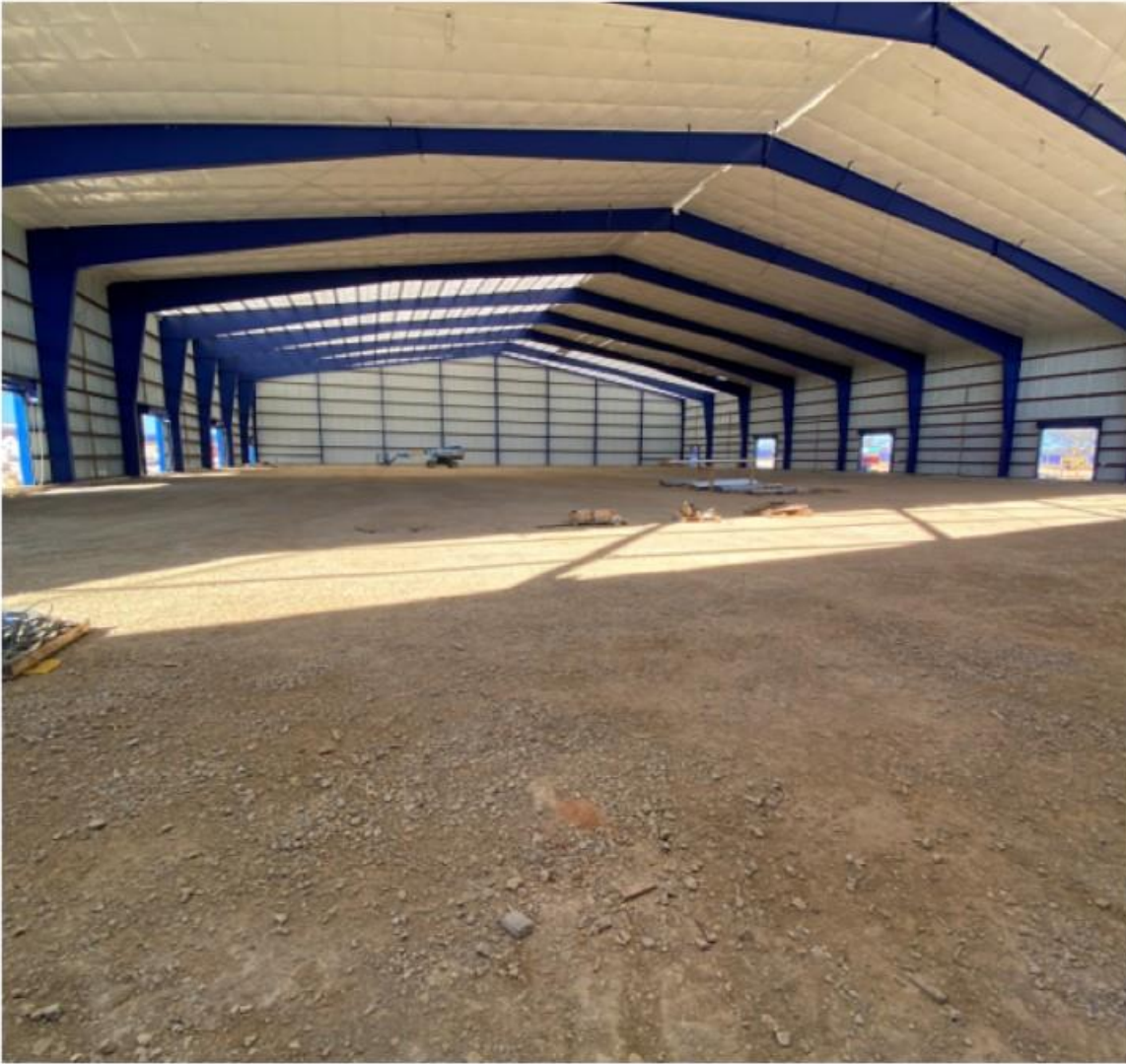
Structural Steel for Practice Field with Paint