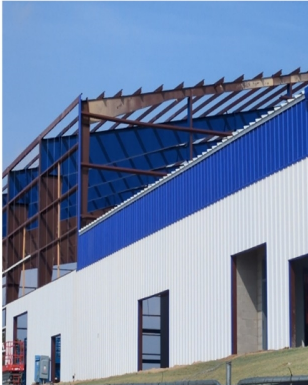
Metal Building Structural Steel at Practice Field