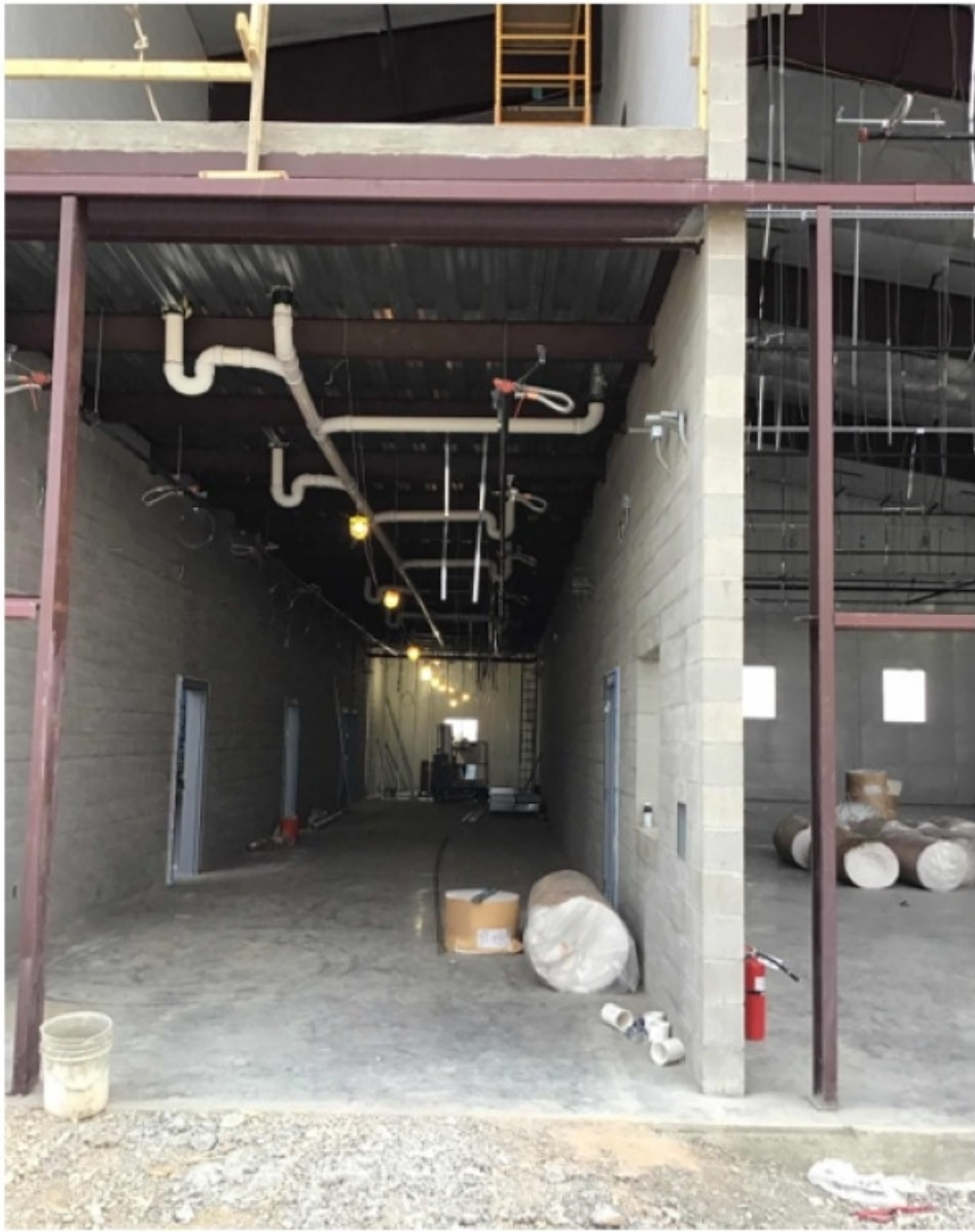
Mezzanine Floor and Corridor