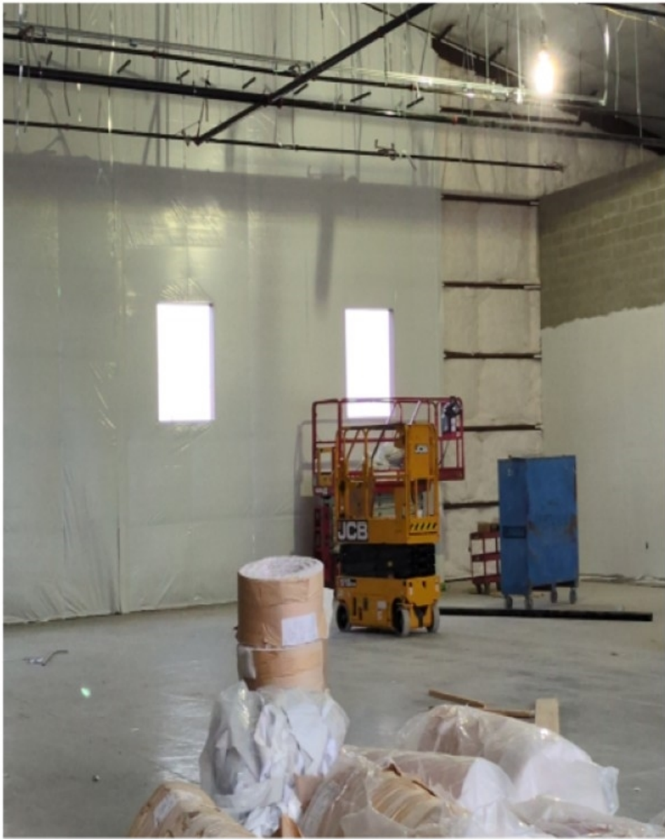
Insulation at Interior of the Building