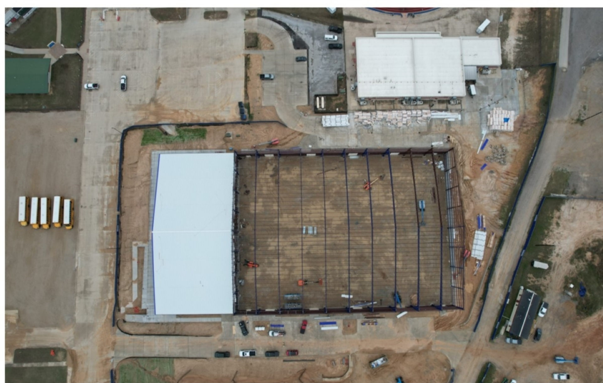
Top View of Building Pad