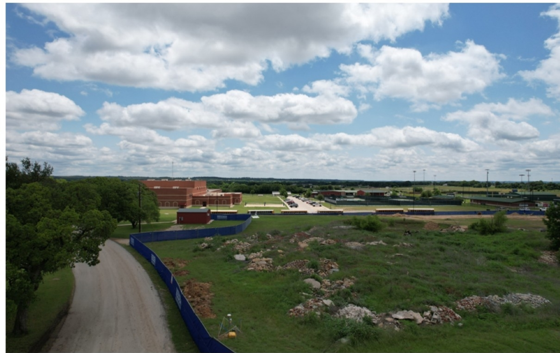
Fencing at the Jobsite