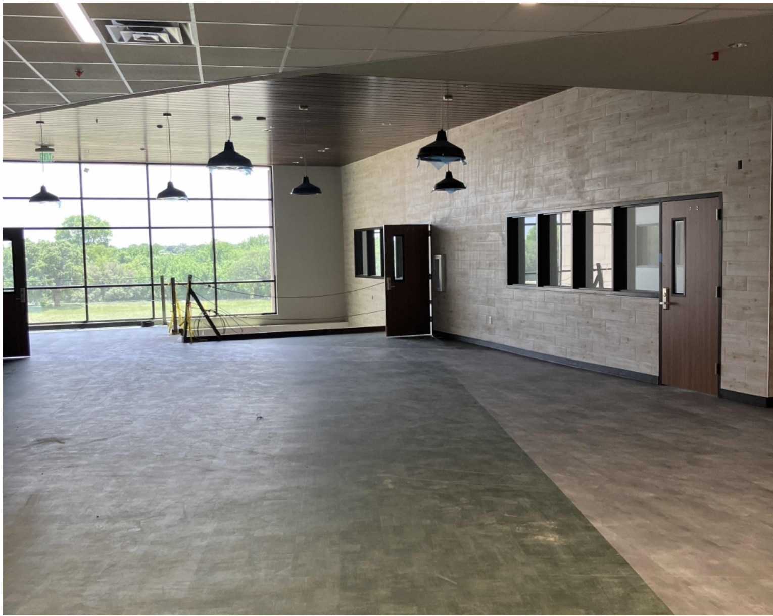
Section 7 – Corridor with Wood Ceiling