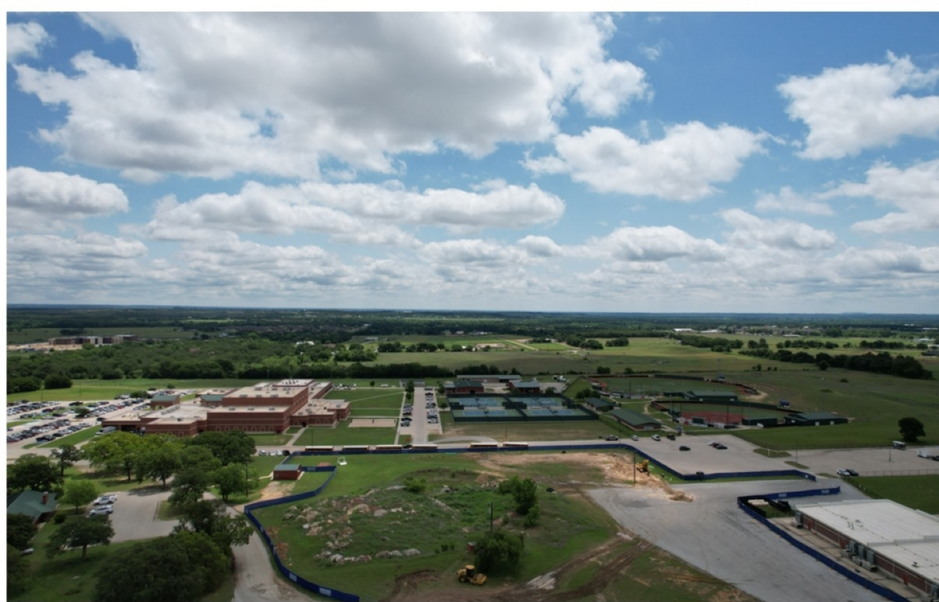
Overview of the Jobsite