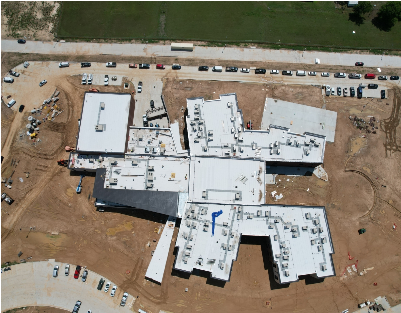
Overall Site View