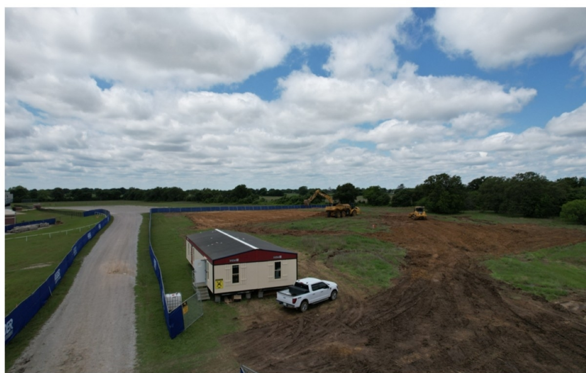
Site Trailer and Burrow Hole