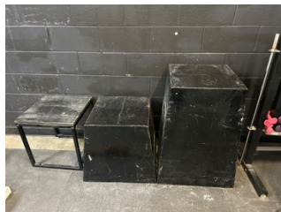
33. Plyo Boxes (x3)