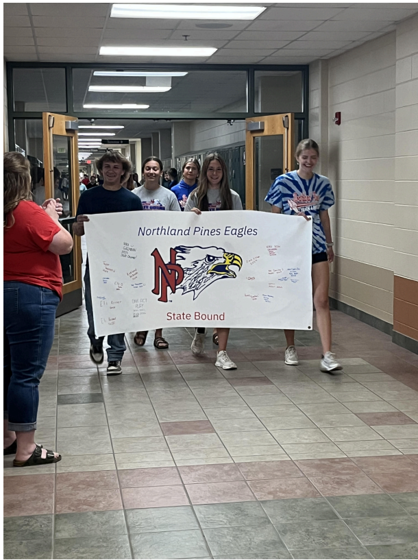
HS State Track Sendoff