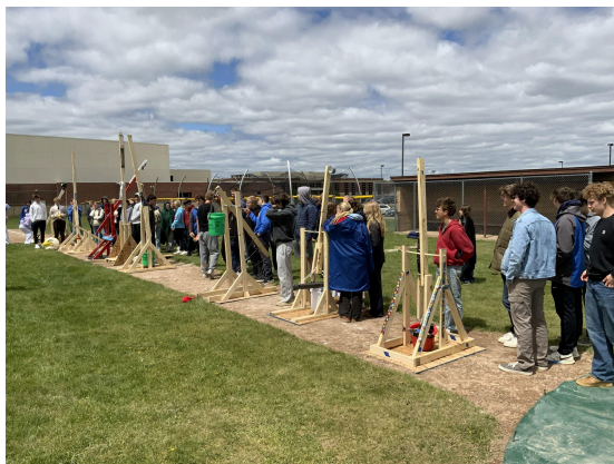
STEM Day Pictures