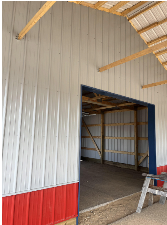
Wood-Mizer Pole Barn