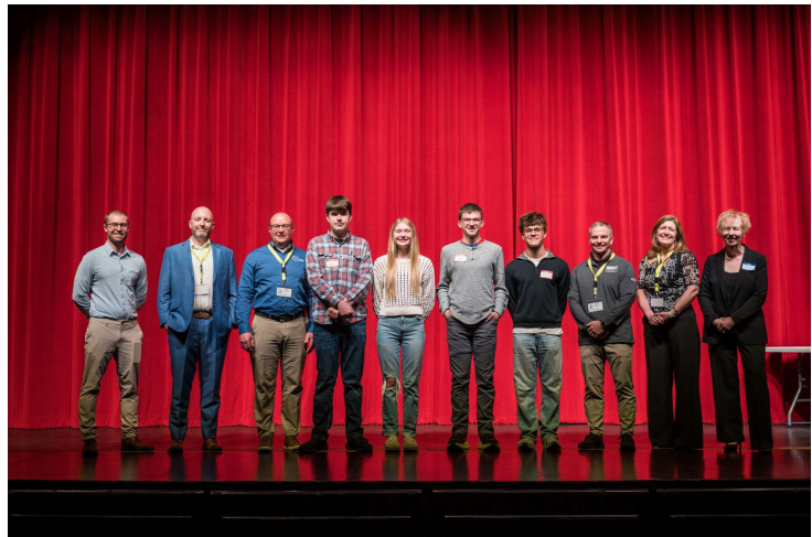
Winning Company and VCEDC Volunteers/Judges