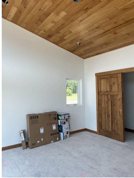
Building Trades House