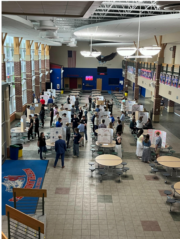
VCEDC Initial Presentations