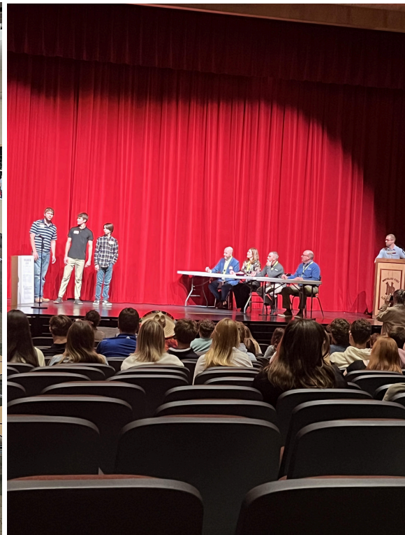
VCEDC Final Presentations