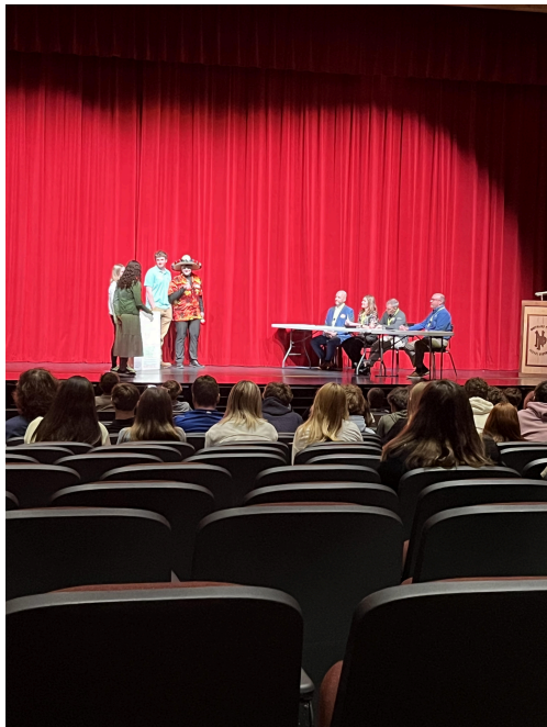
VCEDC Final Presentations