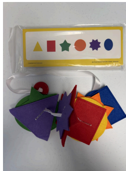
Touch & Feel Letters