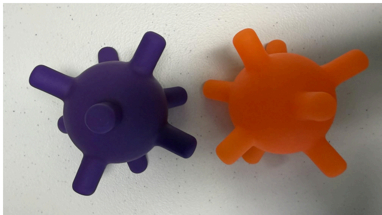
Grab It Balls