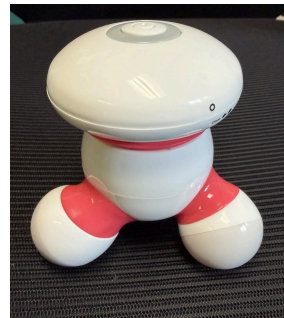
Handheld Vibration Device