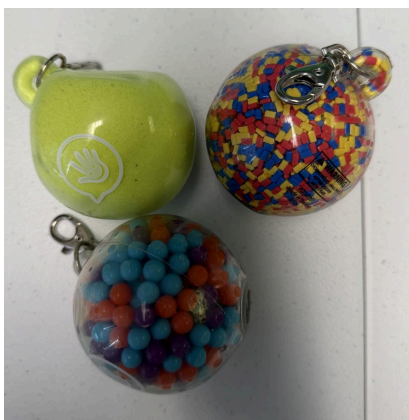
Fidget Key Chain Balls