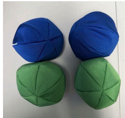
Stressless Fidgets Balls