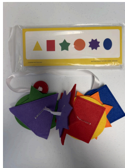
Touch & Feel Letters