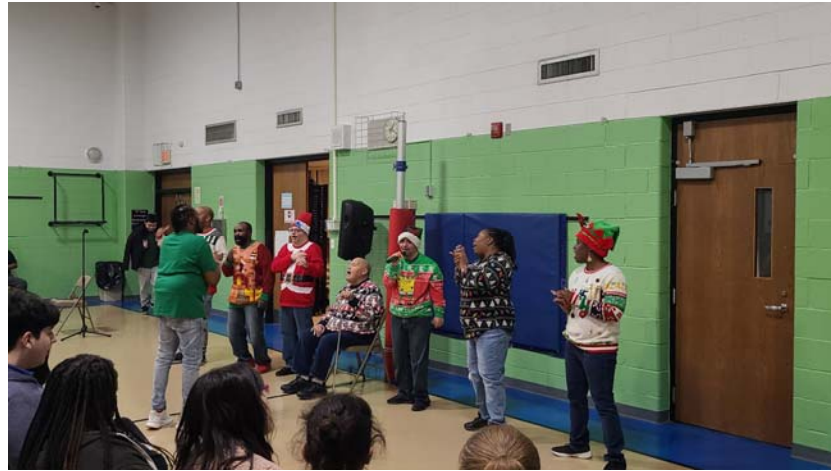
PAEC CENTER CHRISTMAS SINGING 2024