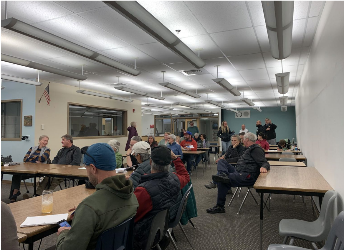
Neighborhood Meeting in East Library - April 2025