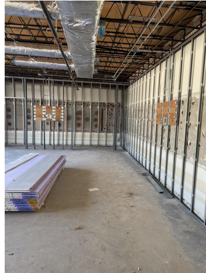
Existing Classroom Framing