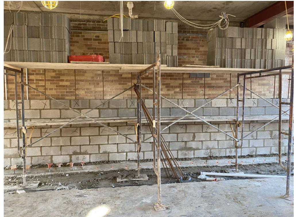
West Shear Wall Masonry for 2 Story Addition