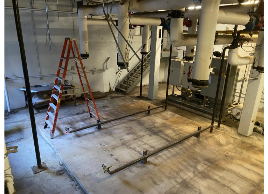
Boiler Demolition Completed