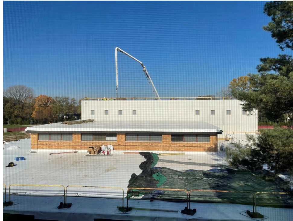
Storm Shelter Concrete Roof Deck Pour