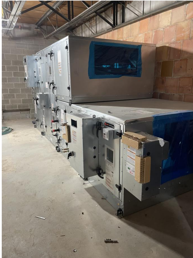
Air Handler #10 Installed at 3 rd Floor Mechanical