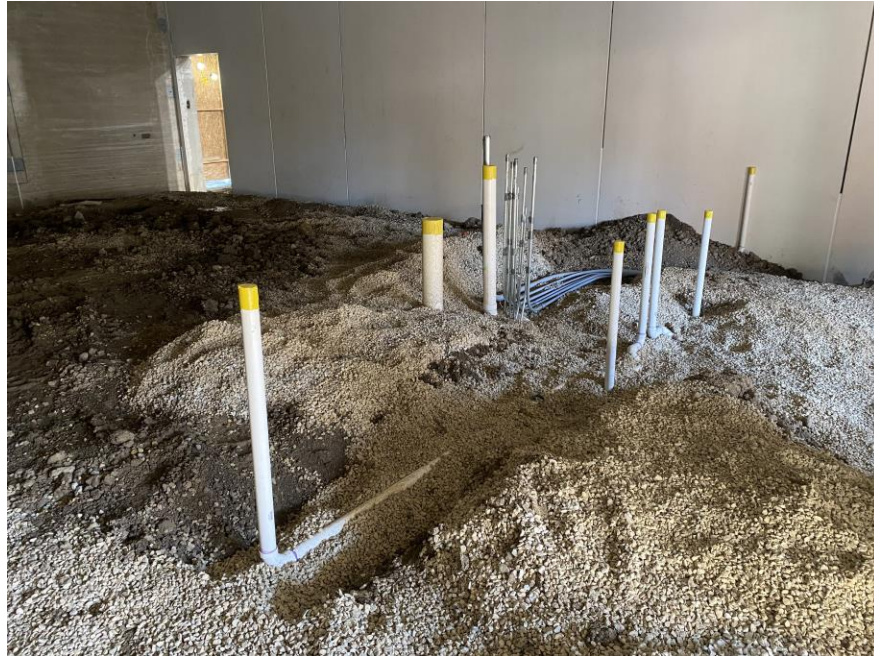
Underground Plumbing at New Gym Locker Rooms