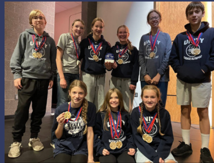
Pictured are members from the Unity “Blue” Team, along with their hard-earned medals!

The Unity Science Olympiad team hosted its second annual Science Olympiad Invitational. Over 20 teams competed at the Middle School level! With over 30 students competing at the Middle School level, it was an exciting opportunity to have THREE teams this year! Congratulations to all of the students on their successes and good luck to them this season!