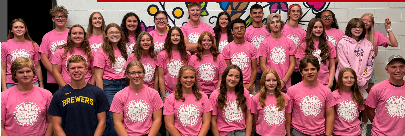
Our AWESOME UHS Student Council Members