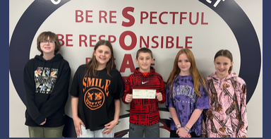
Student Council Officers with the check donated to Heroic Expeditions