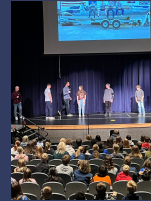
Students participated in a real example of boat conditions