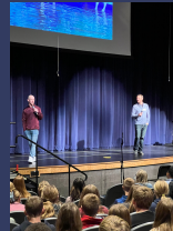
Two members of the HE Team talk to the students about a recent excursion

In total, the middle school raised over $1,000 to donate to this great cause!