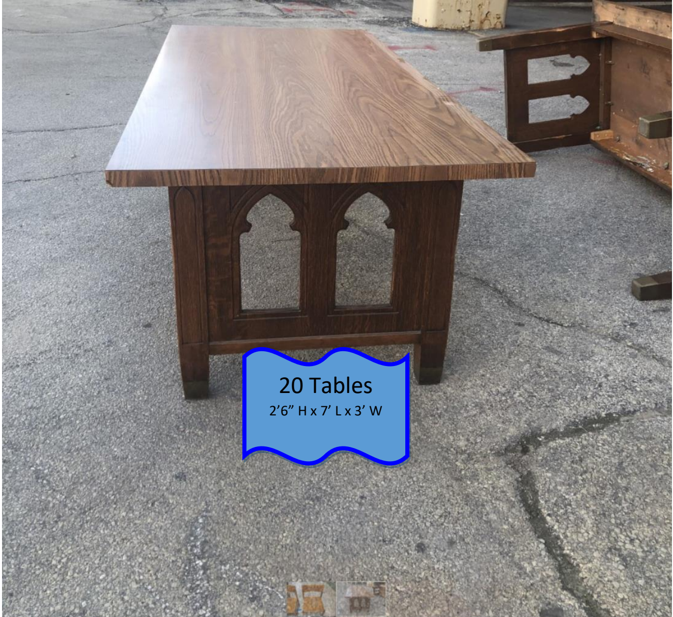
20 Tables 2'6" H x 7' L x 3' W