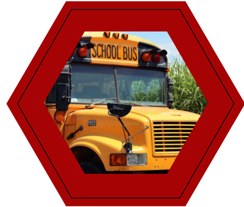
Debt Service Fund