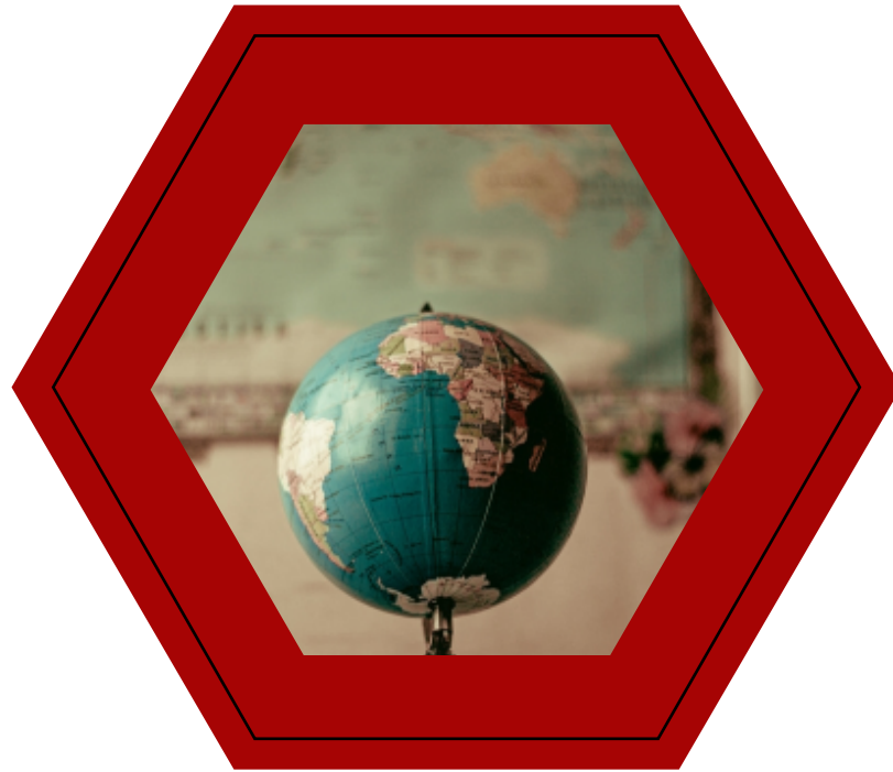
Child Nutrition Fund