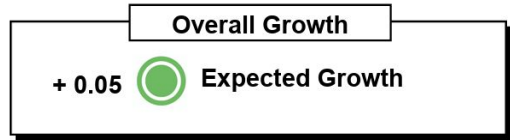
Student Growth by Grade