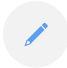
Systems Investments to Improve Billing and Other Efficiencies