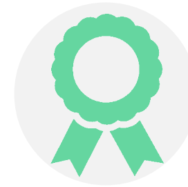
Staff Recognition and Appreciation