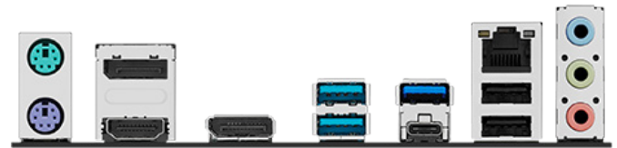
CK722 Slim Chassis