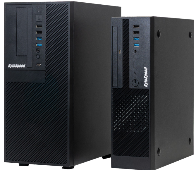
CP712 Mini-Tower Chassis