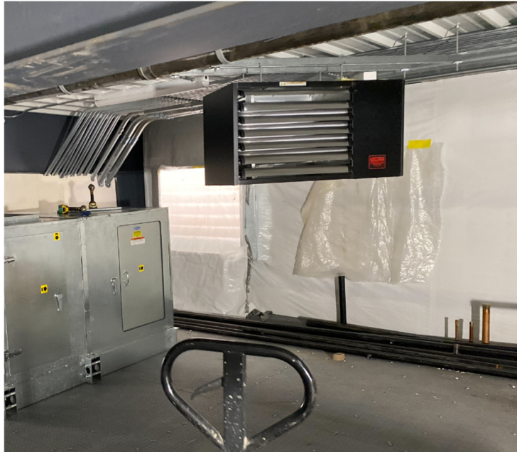
Air handling unit in place on mezzanine