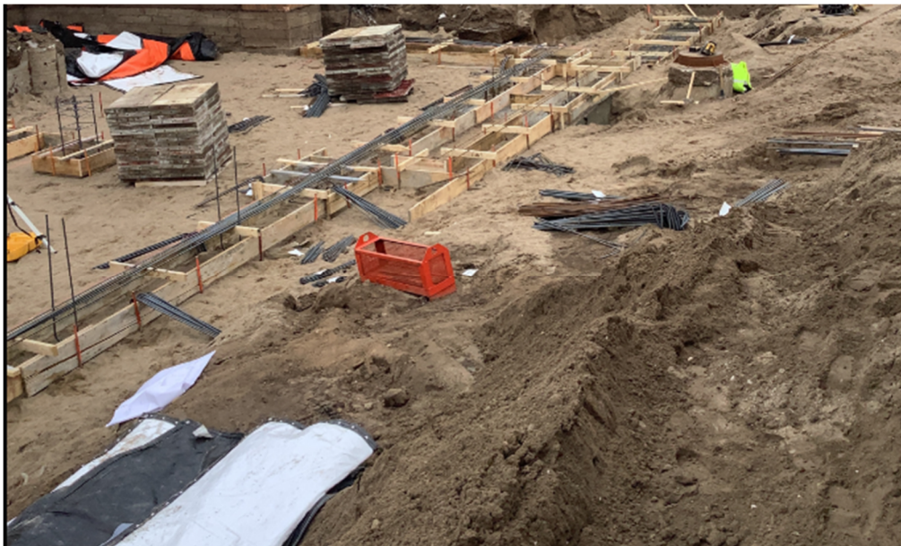
North Side Foundation Work