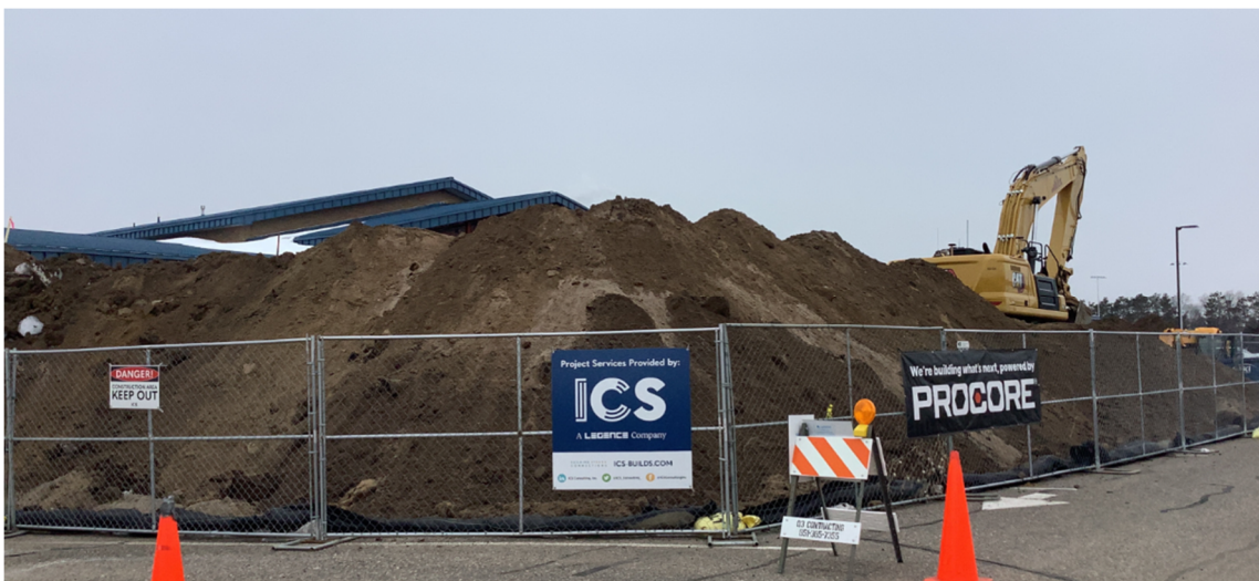
Middle School North side excavation