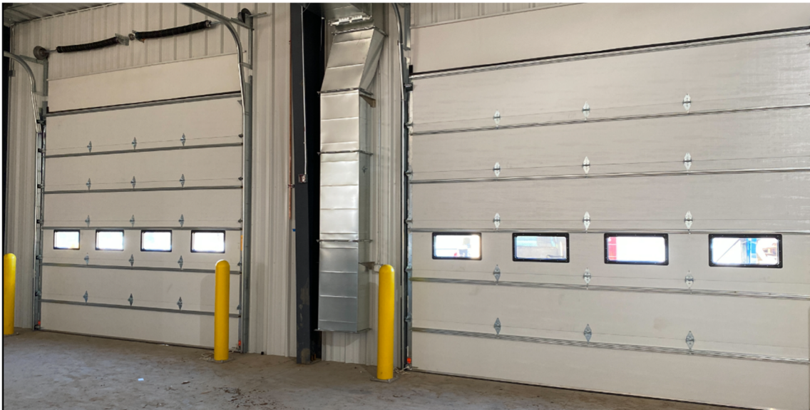
Area B overhead doors installed