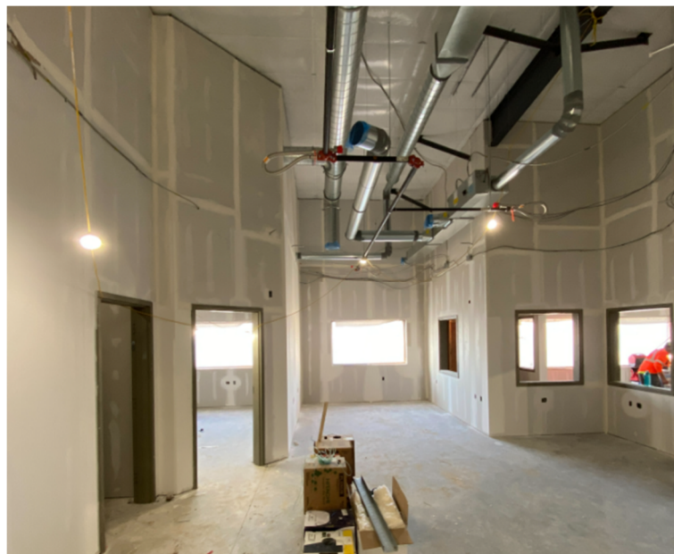
Getting prepped for paint