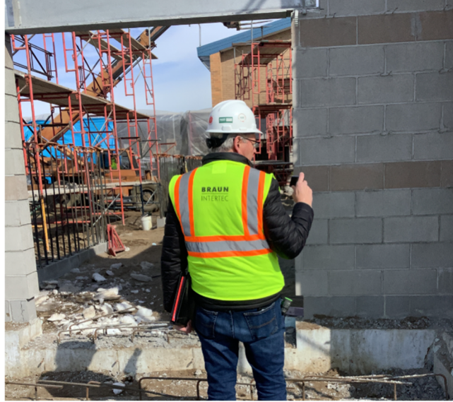
Storm Shelter Structural Inspections