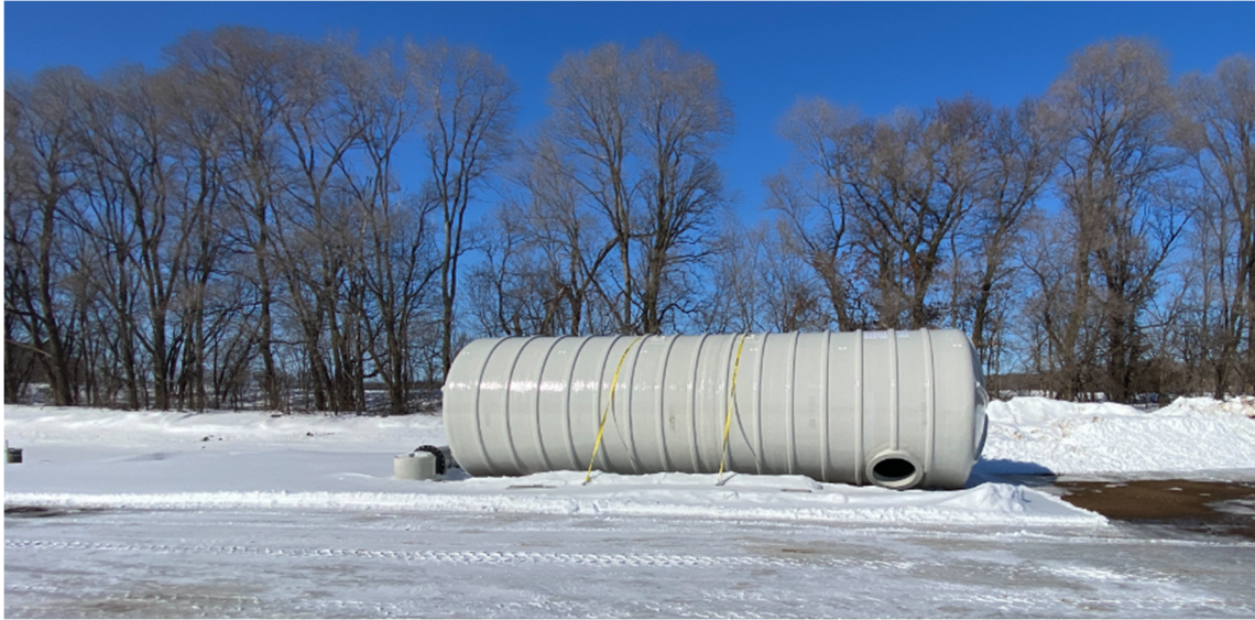
Before and after tank burial. We are getting some snow melt!