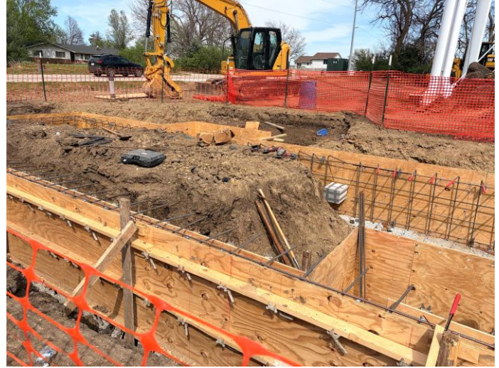
4/13: Setting forms and rebar for booster pump station foundation.