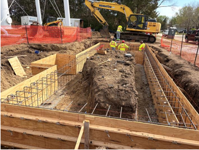
4/13: Setting forms and rebar for booster pump station foundation.