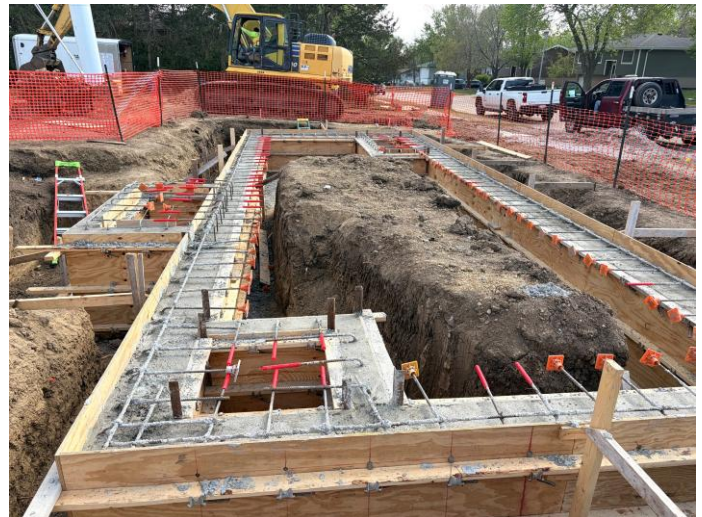
4/15: Completion of concrete foundation pour.