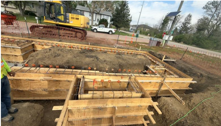
4/15: Rebar inspection prior to concrete foundation pour.