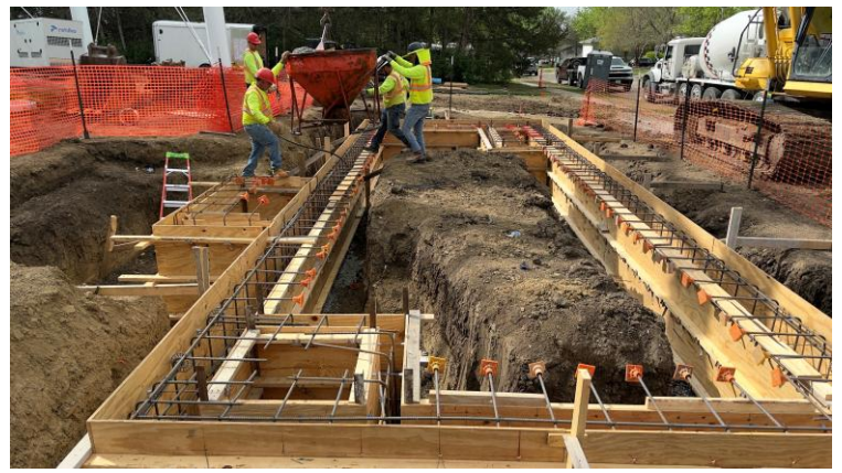
4/15: Concrete pour of foundation.