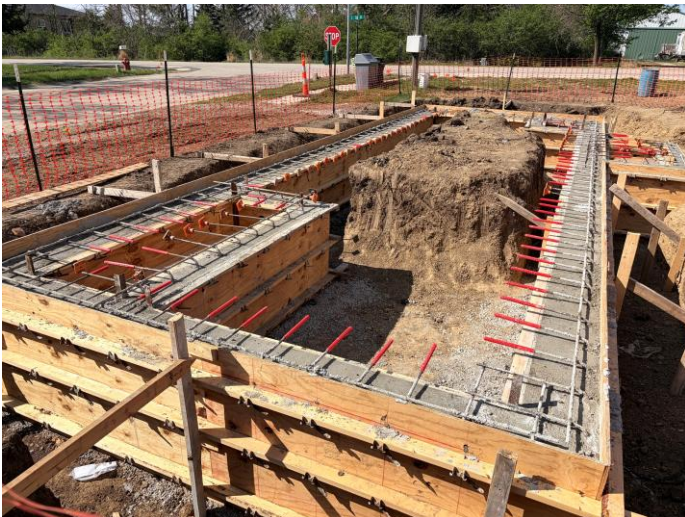
4/15: Completion of concrete foundation pour.