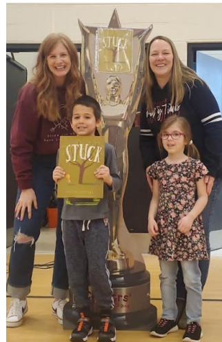
Cougar Reading Madness 2023 Champ– STUCK