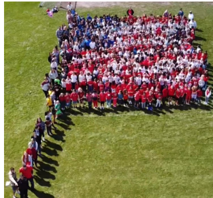
CT Students and Staff– Ariel Mural