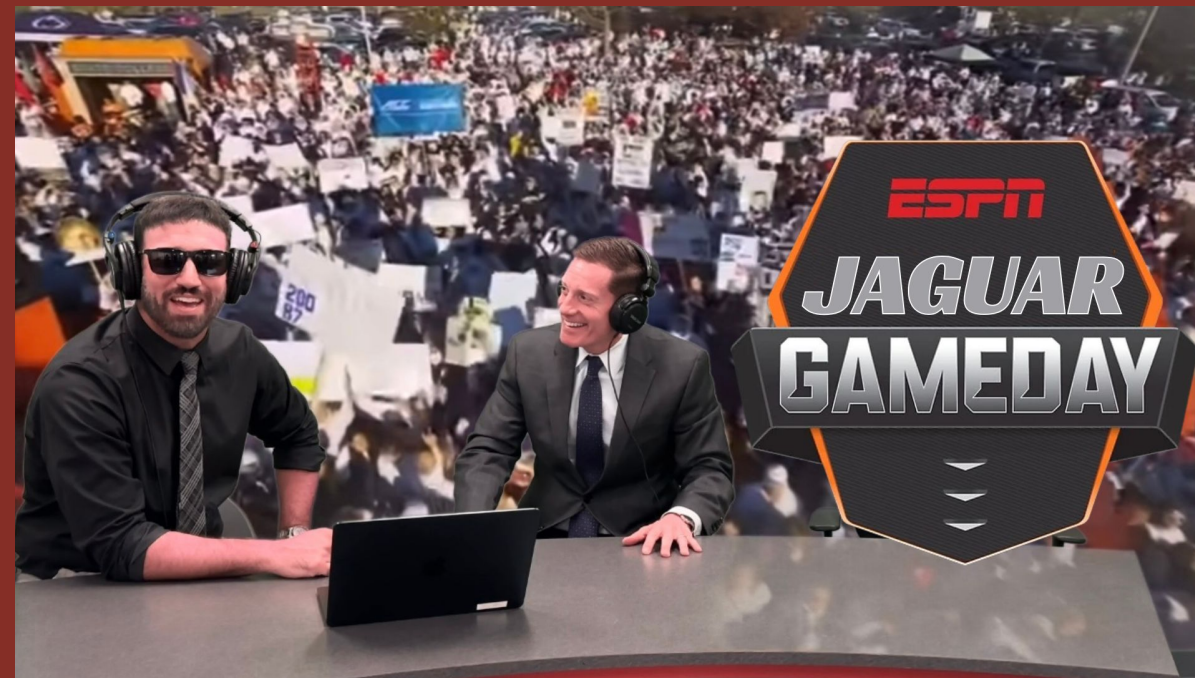
Promotion videos build anticipation