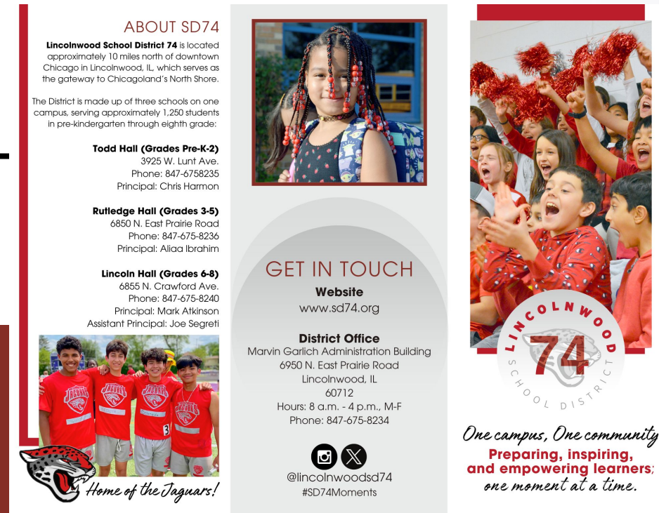
Career Fair banner and trifold