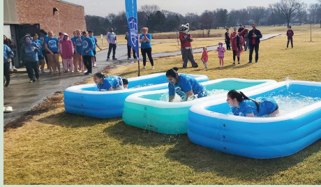
MacArthur students brave the icy water.

The temperature may have been slightly warmer than normal for early March, but the water was icy cold. That didn't stop brave students, staff and community partners from taking the Polar Plunge on March 6 outside of MacArthur. They dove right in as part of the Cool School Challenge, raising more than $20,000 for Special Olympics of Illinois.