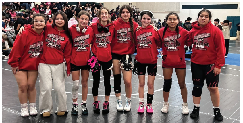
MacArthur's program has benefited from the growth of girls wrestling, with 15 girls joining the team this year and contributing to the historic season.