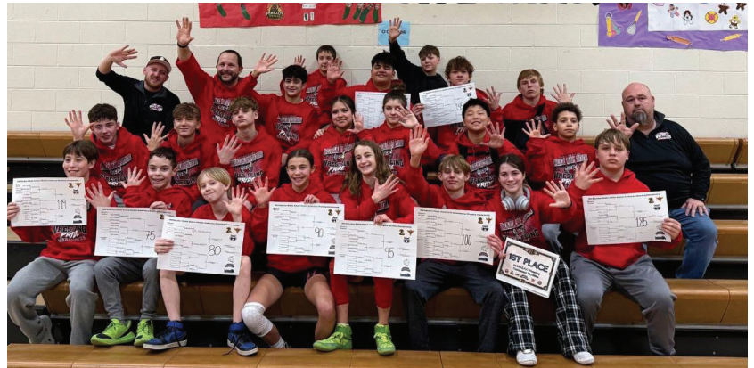
MacArthur wrestlers celebrate their winning streak and perfect record.

MacArthur is following the nationwide trend of a huge increase in the number of girls joining wrestling teams, from middle school through college. In fact, girls wrestling is the fastest-growing high school sport in Illinois, according to the IHSA (Illinois High School Association).