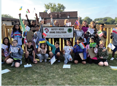
Ross and Sullivan students celebrate the opening of The Learning Patch.