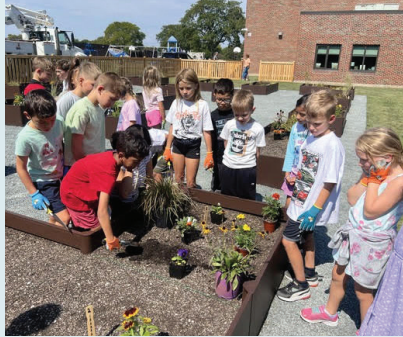
Students plant flowers in the garden boxes that were donated by the PTO.