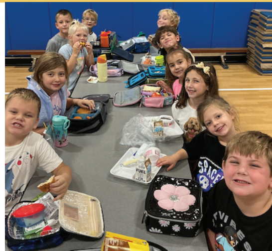
Eisenhower students at lunchtime.

Yes, it will likely be necessary to reduce some staffing and/or programs to help offset the added operational costs of full-day kindergarten and the Eisenhower expansion, such as staffing, supplies and utilities. This is because