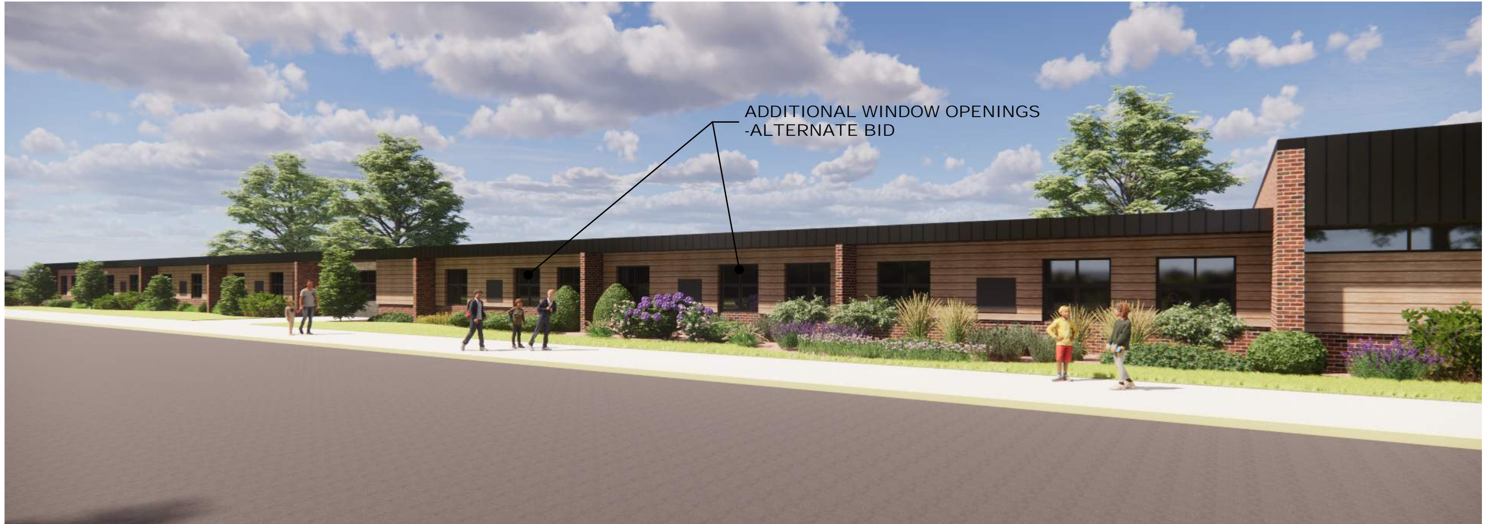
NEW PANELING REPLACES OLD PANELING ON SCHOOL ELEVATION, NEW WINDOW TYPE, AND NEW WINDOW FENESTRATION