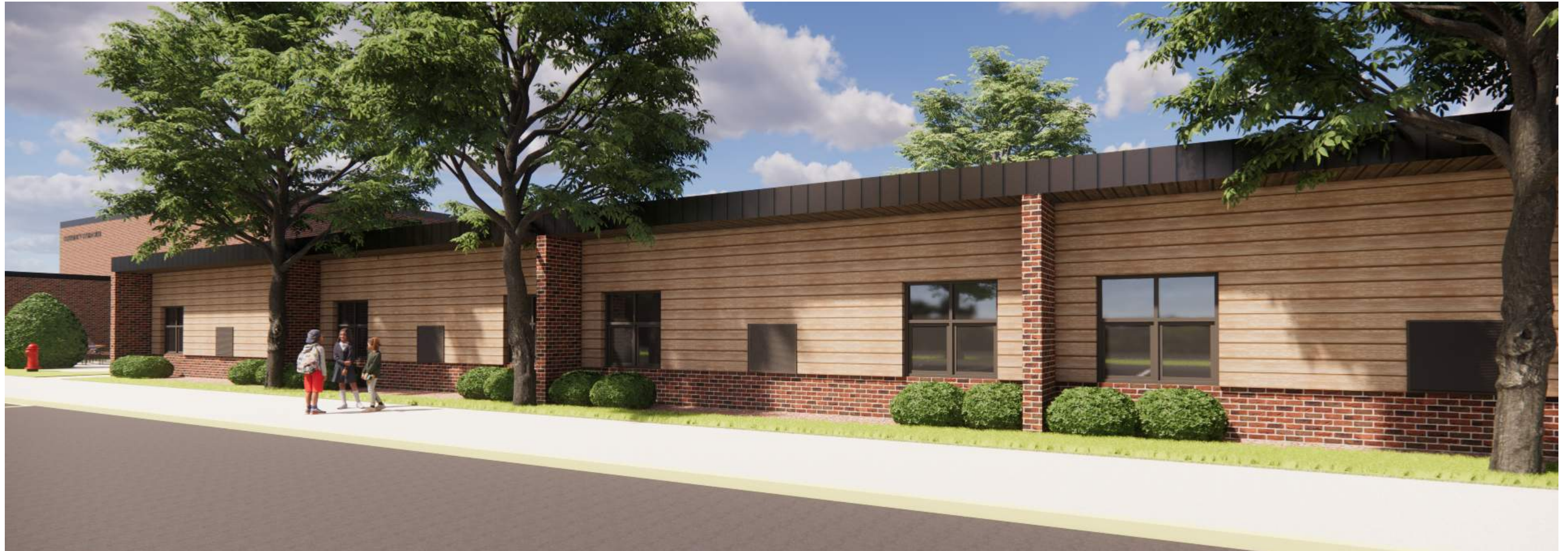
NEW PANELING REPLACES OLD PANELING ON SCHOOL ELEVATION AND NEW WINDOW TYPE