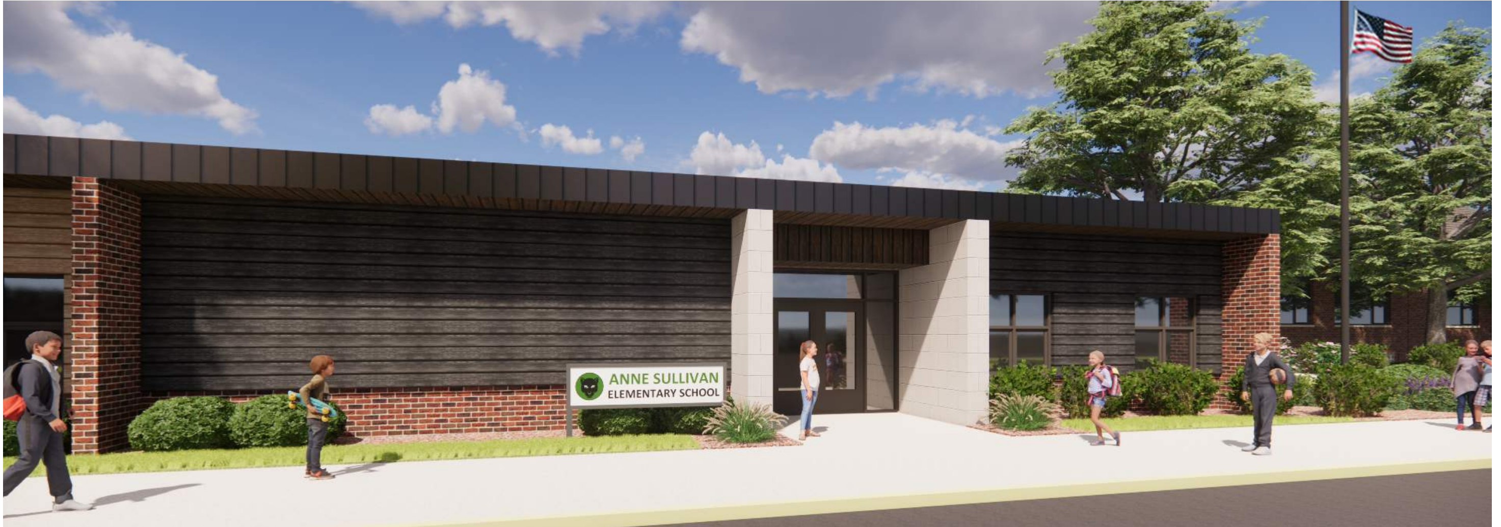
NEW PANELING OVER EXISTING BRICK AT SCHOOL ENTRANCE