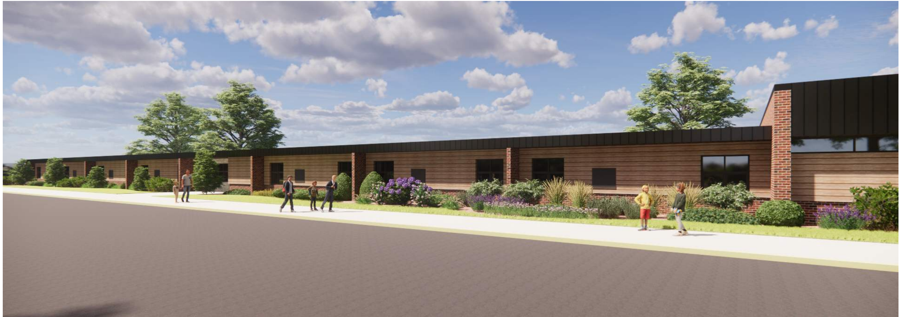
NEW PANELING REPLACES OLD PANELING ON SCHOOL ELEVATION AND NEW WINDOW TYPE