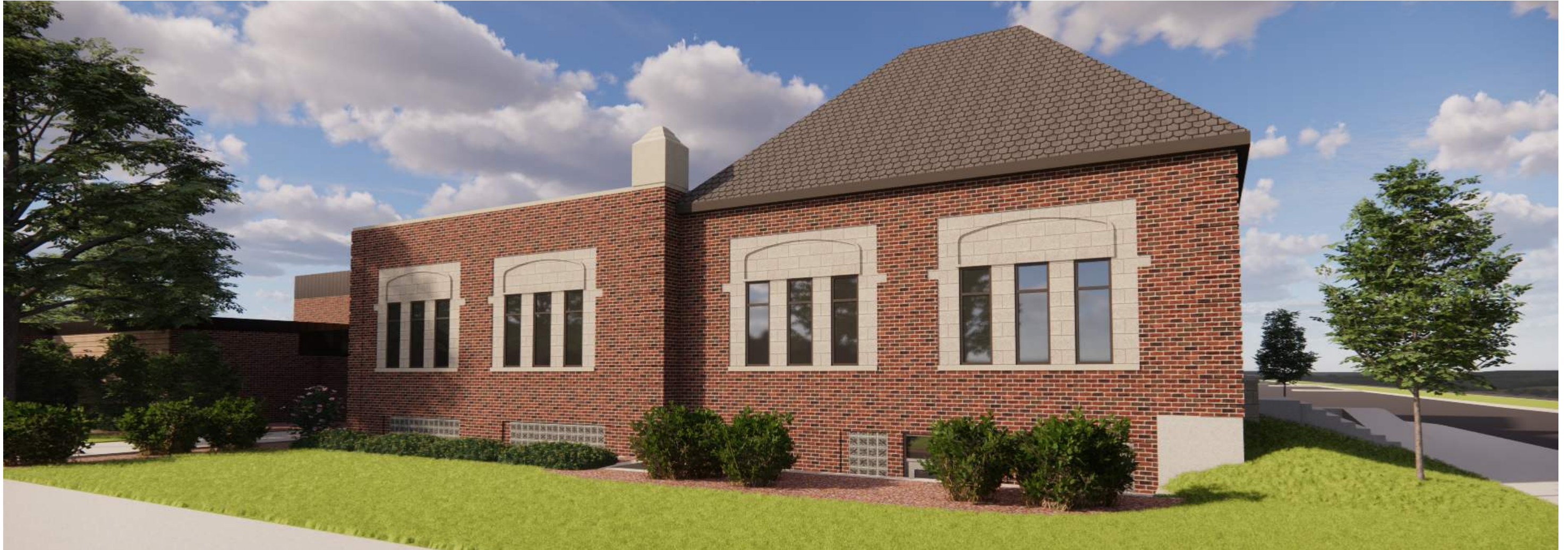
REMOVE PANELING ON ADMIN CENTER ELEVATION AND REPLACE WITH NEW WINDOW TYPE