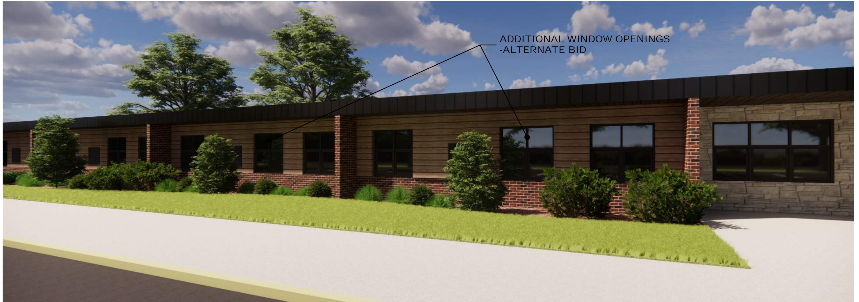
NEW PANELING REPLACES OLD PANELING ON SCHOOL ELEVATION, NEW WINDOW TYPE, AND NEW WINDOW FENESTRATION