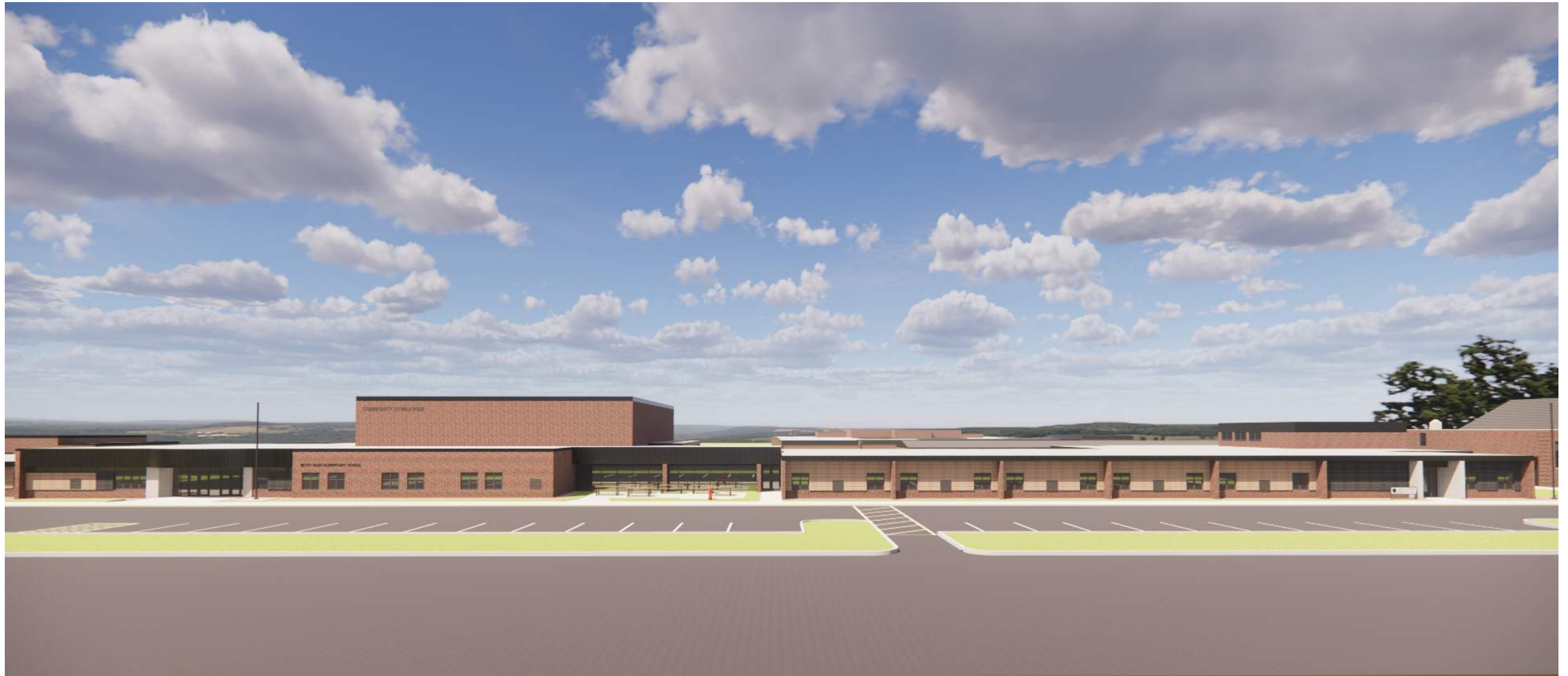
NEW PANELING OVER EXISTING BRICK AT EACH SCHOOL ENTRANCE