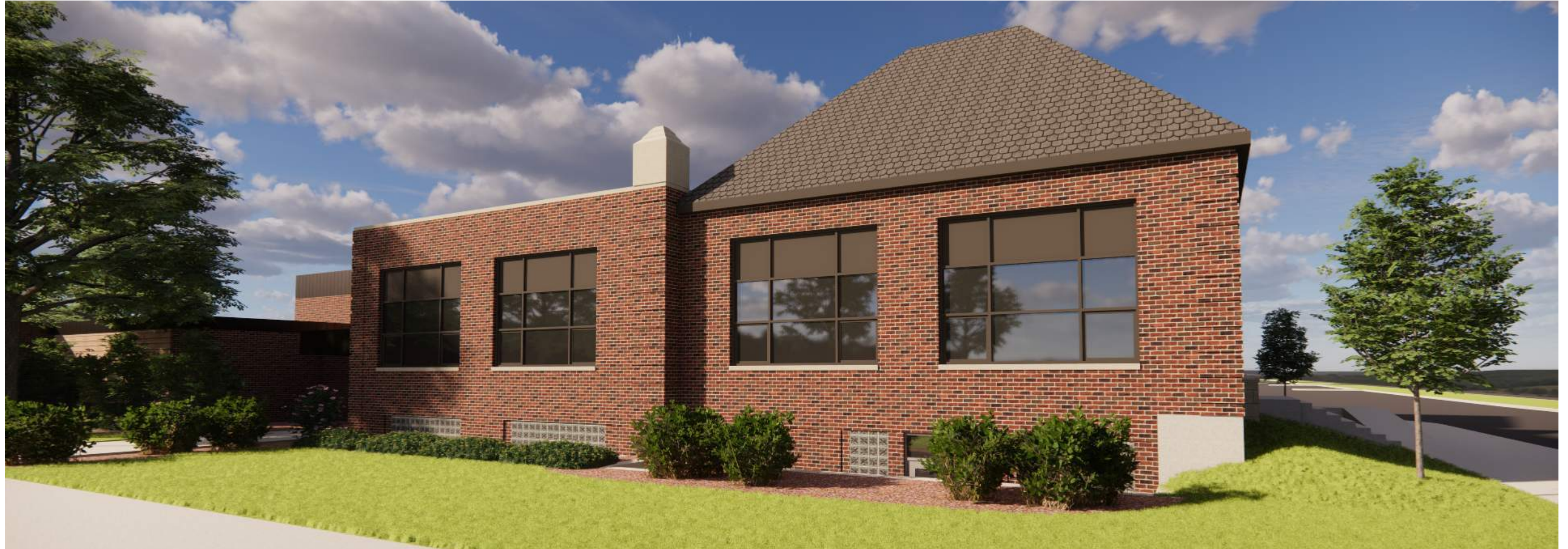
REMOVE PANELING ON ADMIN CENTER ELEVATION AND REPLACE WITH NEW WINDOW TYPE