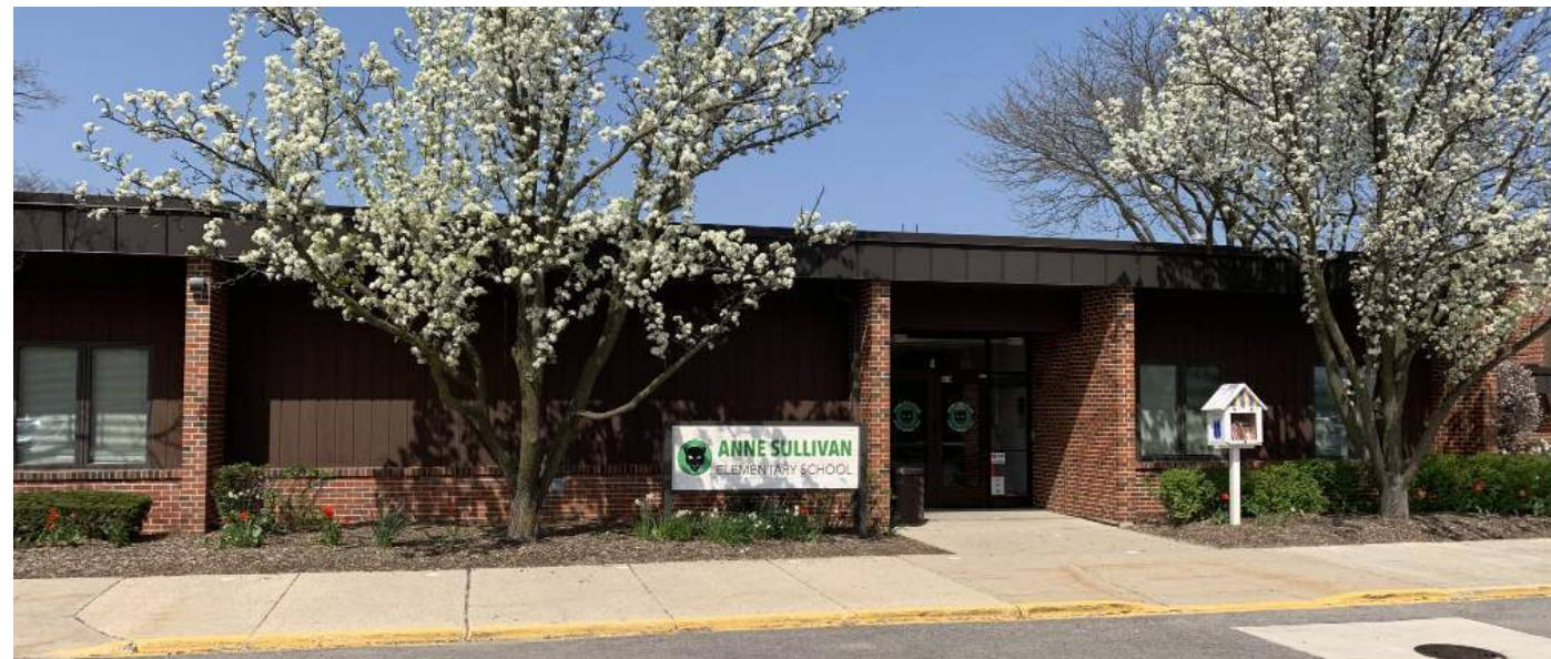
EXISTING SCHOOL ENTRANCE