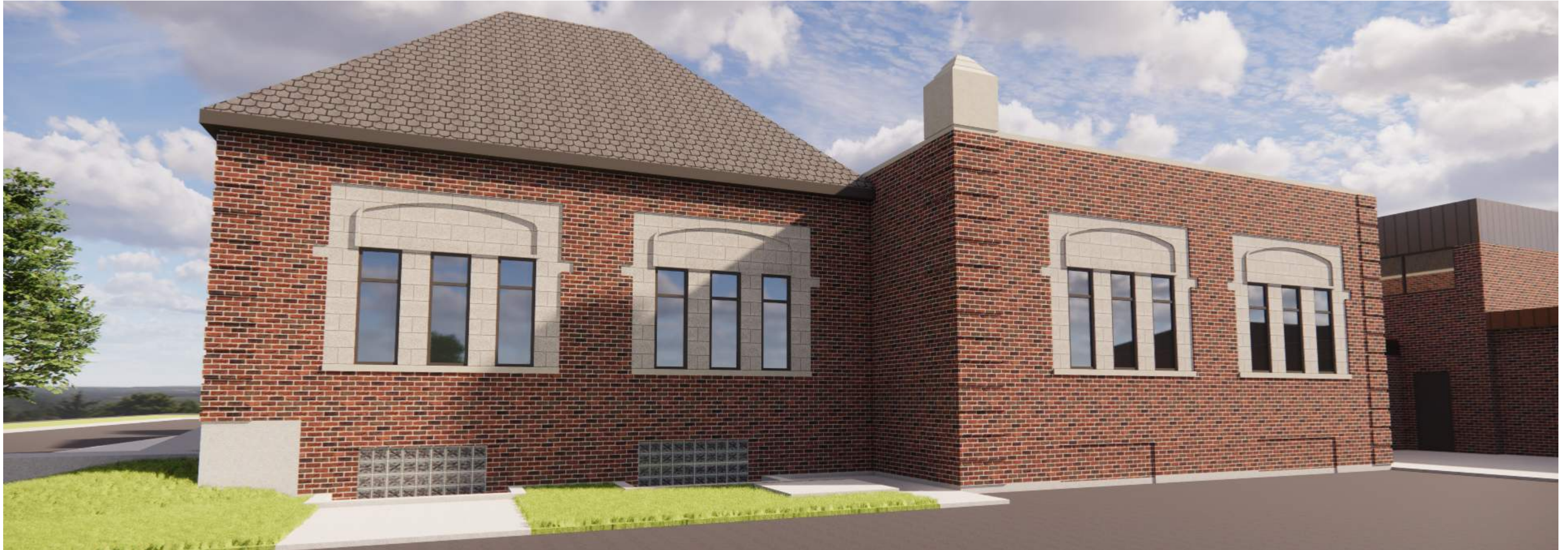
REMOVE PANELING ON ADMIN CENTER ELEVATION AND REPLACE WITH NEW WINDOW TYPE