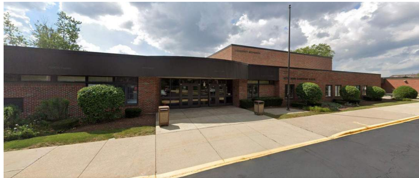
EXISTING SCHOOL ENTRANCE