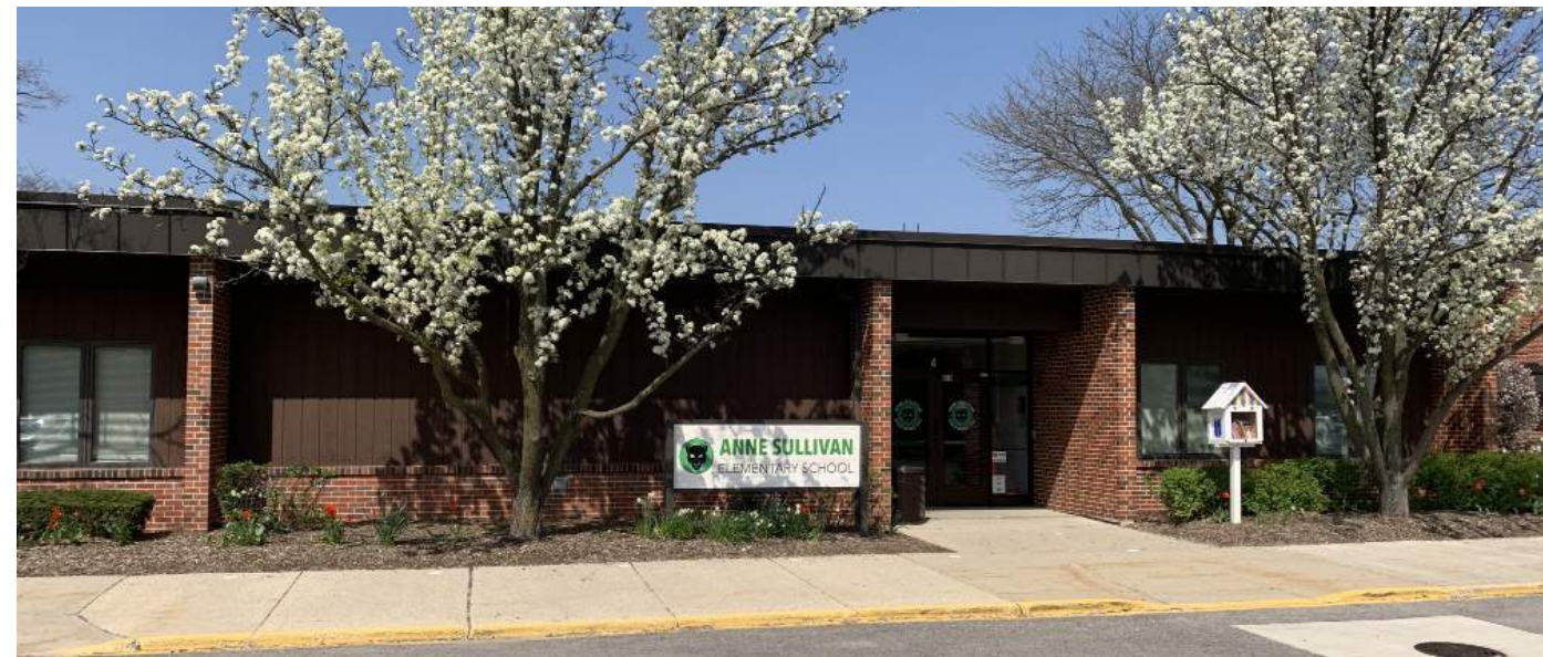
EXISTING SCHOOL ENTRANCE