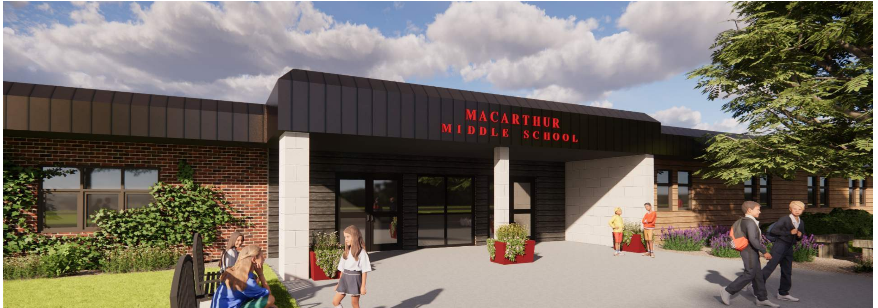
NEW PANELING OVER EXISTING BRICK AT SCHOOL ENTRANCE