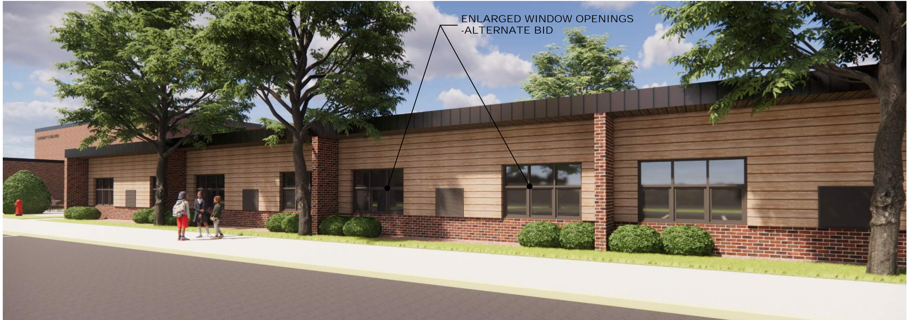
NEW PANELING REPLACES OLD PANELING ON SCHOOL ELEVATION, NEW WINDOW TYPE, AND ENLARGED WINDOW FENESTRATION