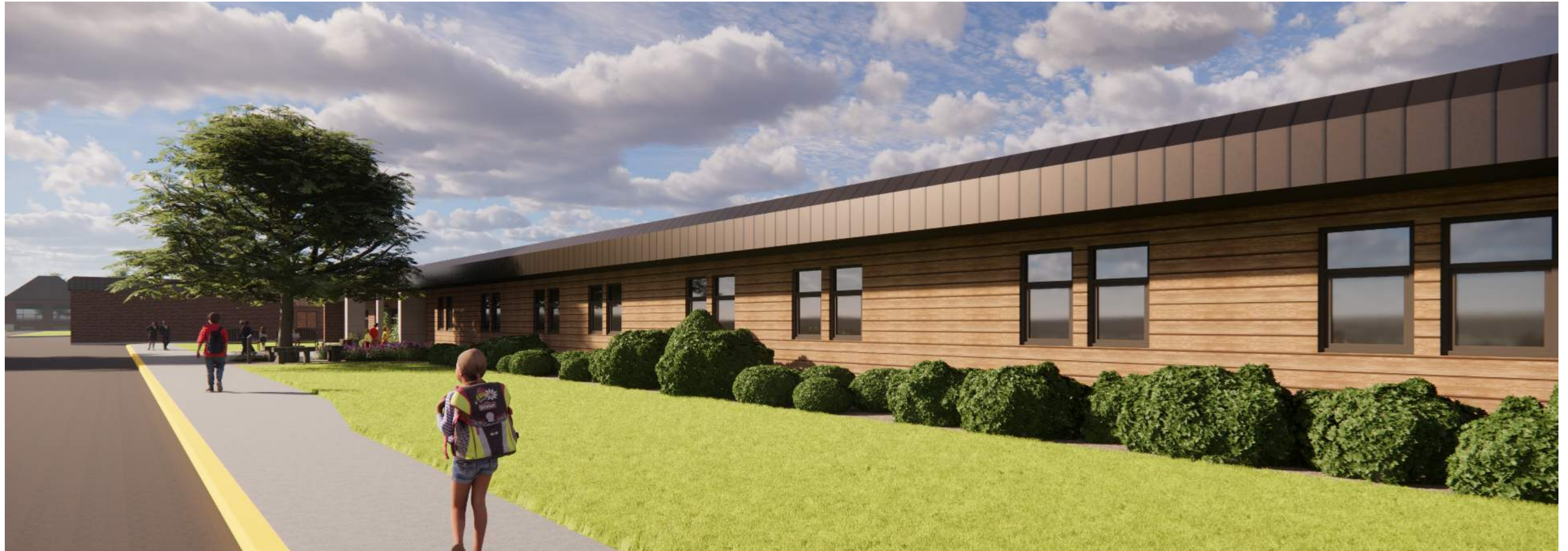
NEW PANELING REPLACES OLD PANELING ON SCHOOL ELEVATION AND NEW WINDOW TYPE