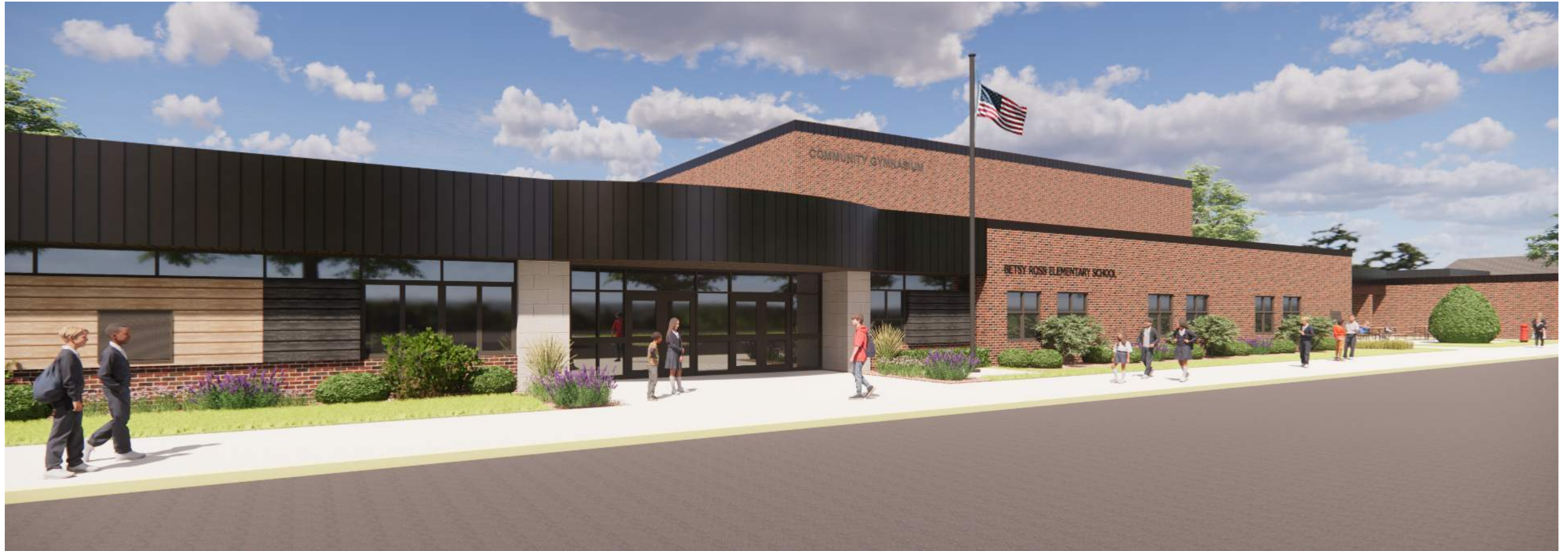
NEW PANELING OVER EXISTING BRICK AT SCHOOL ENTRANCE