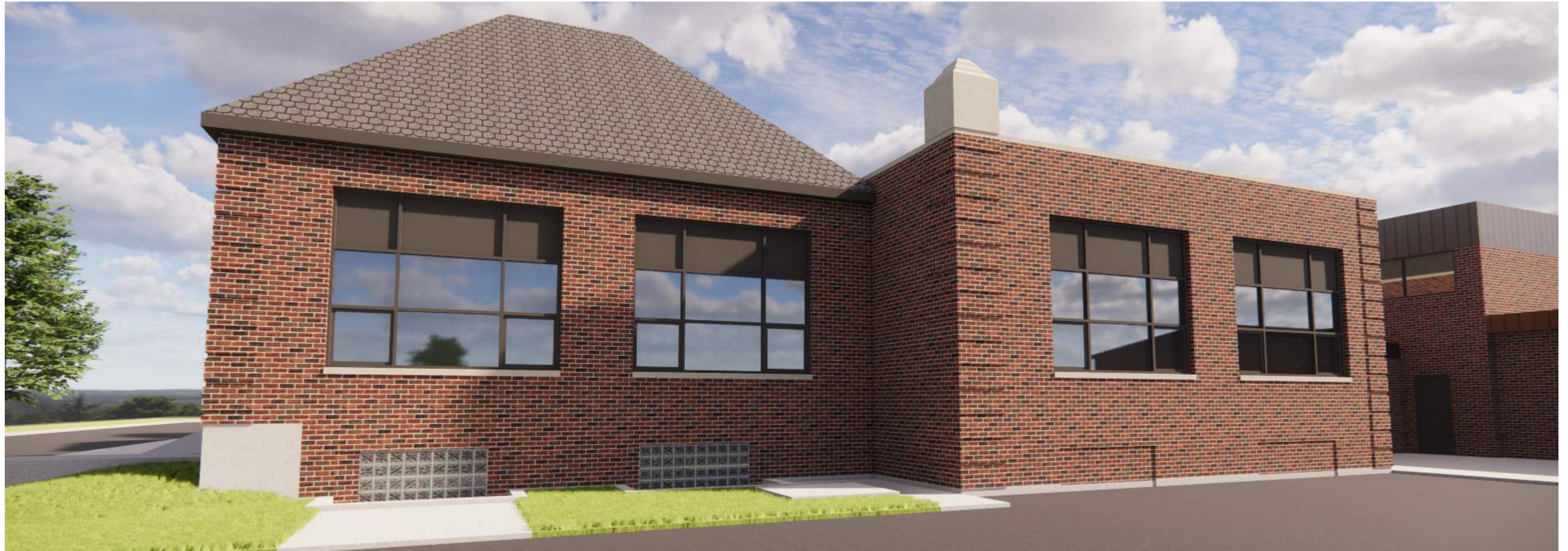
REMOVE PANELING ON ADMIN CENTER ELEVATION AND REPLACE WITH NEW WINDOW TYPE