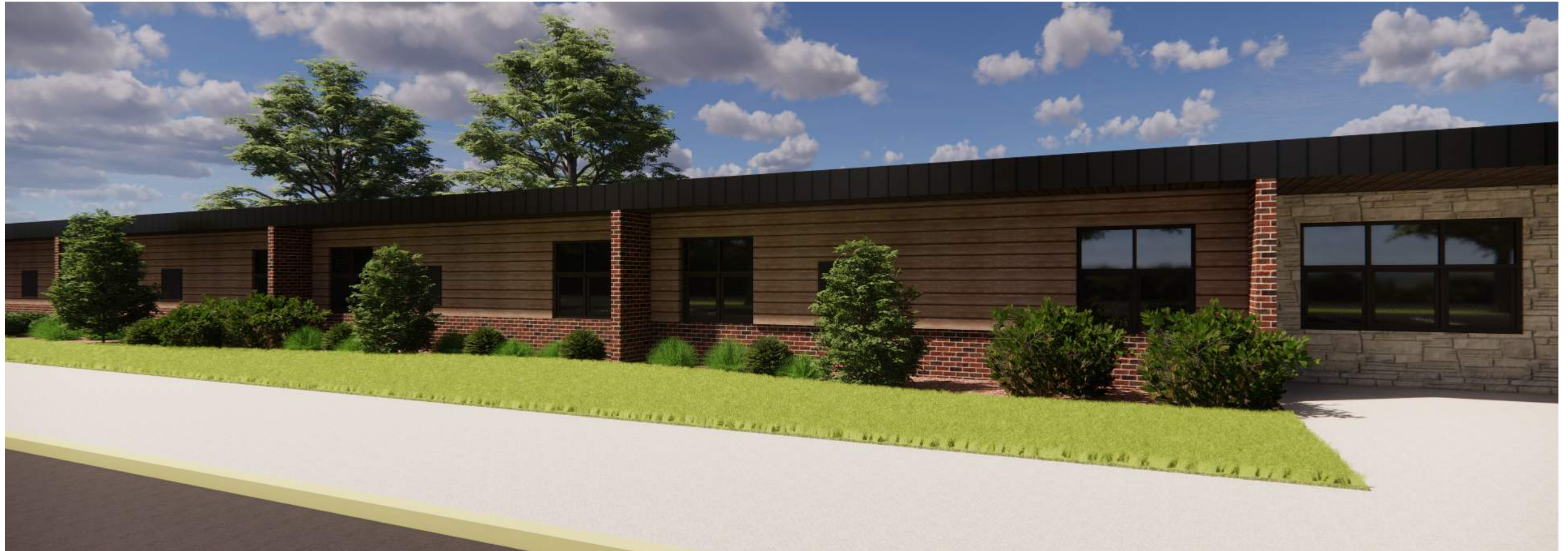
NEW PANELING REPLACES OLD PANELING ON SCHOOL ELEVATION AND NEW WINDOW TYPE