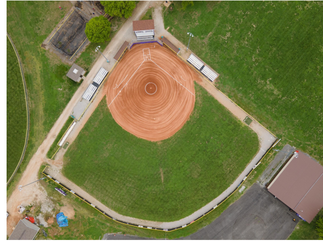
Stan Schaeffer Field

All photos and videos can be accessed with this link: