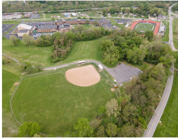
Russ Keene Field