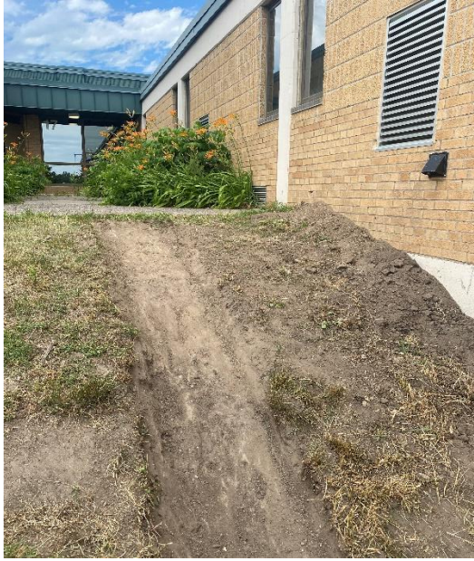
Trench at the MS to divert water from entering the building.