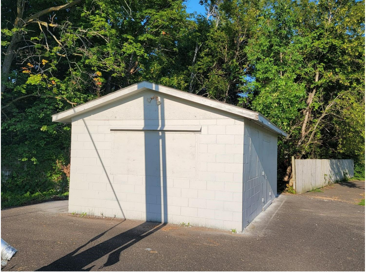
Picture of finished city shed