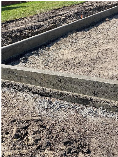
Elementary Playground footings and drainage started