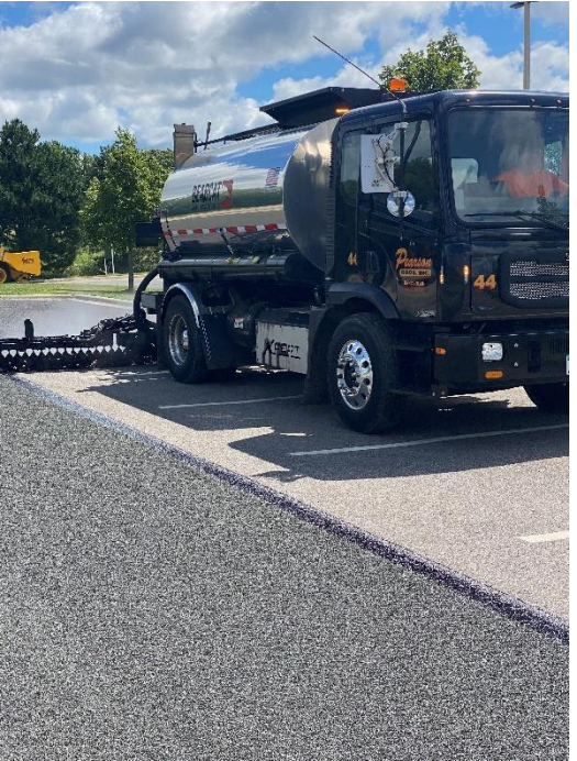
Seal and rock chip at the HS, RCC and bus garage