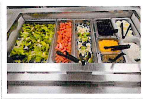
Fresh Fruits and Vegetables