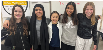
Hennepin EMS Sock Drive student leaders