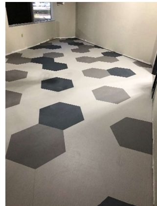
Renovation of Faculty Breakroom