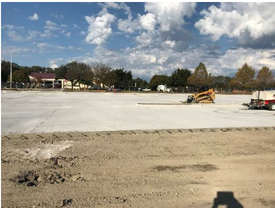
New Parking at Southwest End