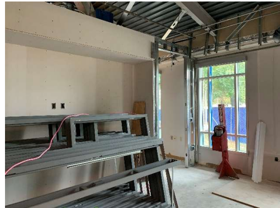
IDF Room at Founders Hall