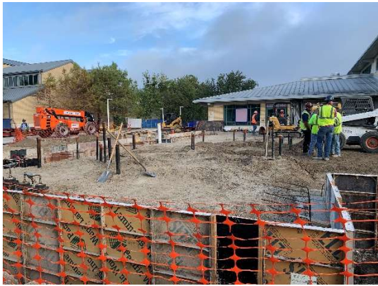
Slab Prep Outside of Alumni Hall