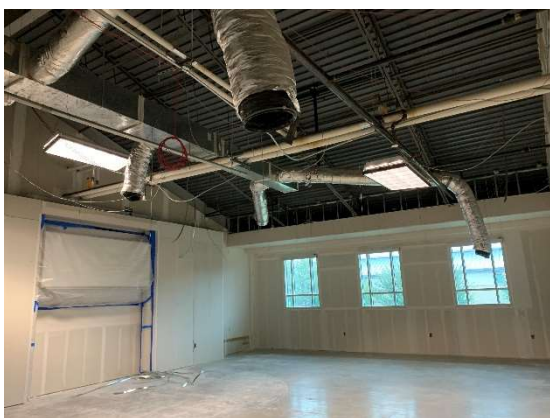
2 nd Floor Classroom at Heritage Hall