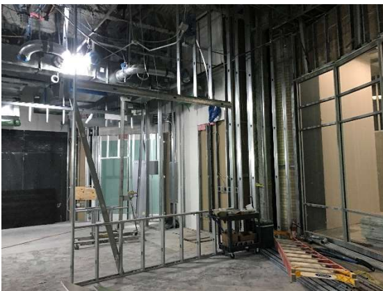
Kitchen Serving Line Wall