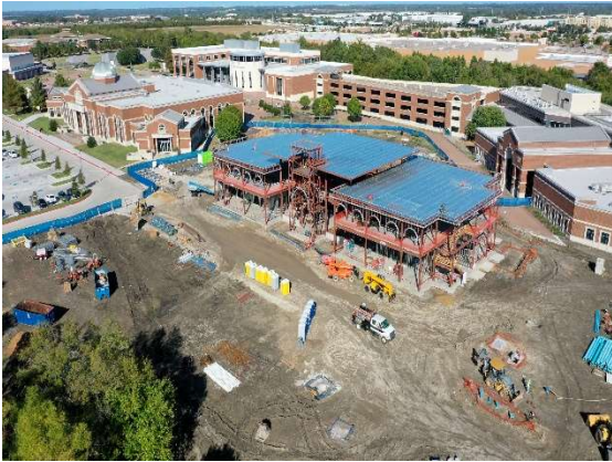
October '21 Aerial of Welcome Center