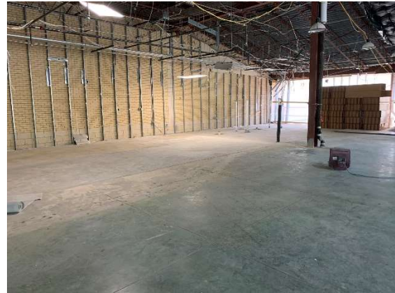
Dining Area at Alumni Hall