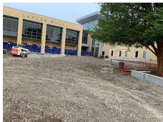
Prepping for Paving at Lawler Hall