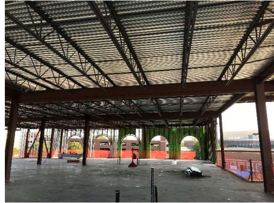
Welcome Center 2 nd Floor Arch Windows