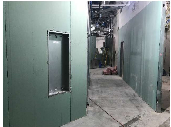
Kitchen Supply Corridor