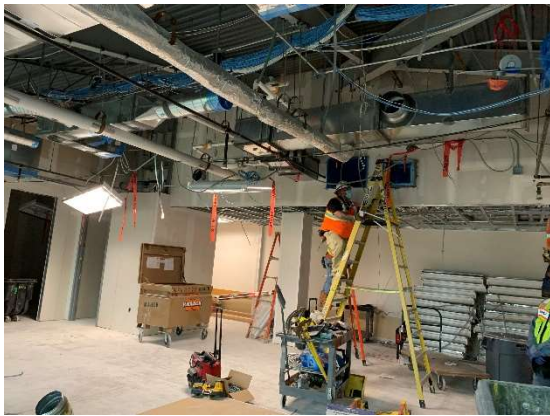
Career Center at Founders Hall