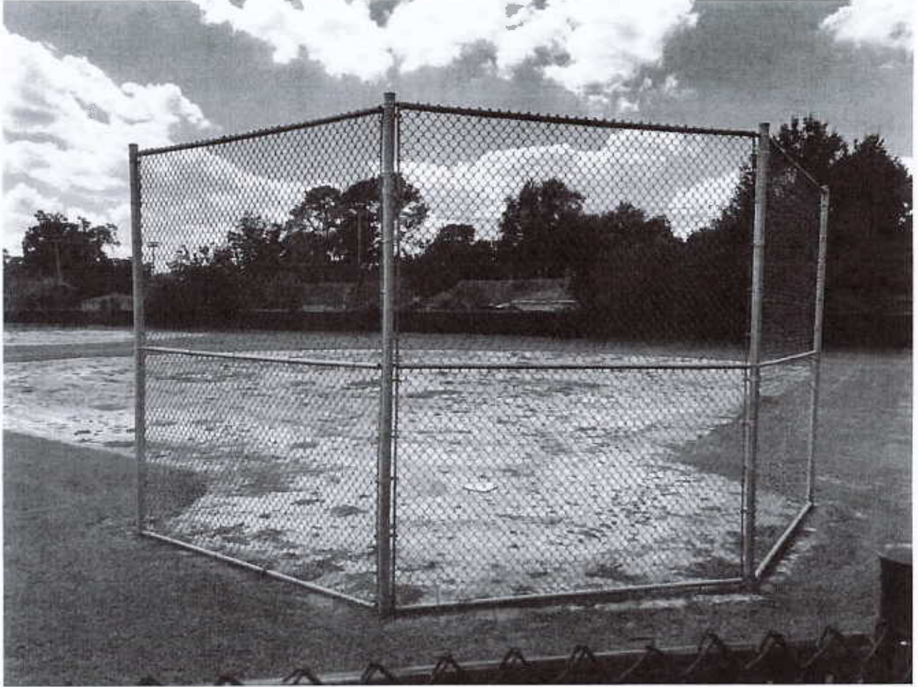
Same design and construction as the chain-link backstop installed at Spring Woods Middle School by Diamond Kuts, located at 9810 Neuens Rd, Houston, TX 77080.