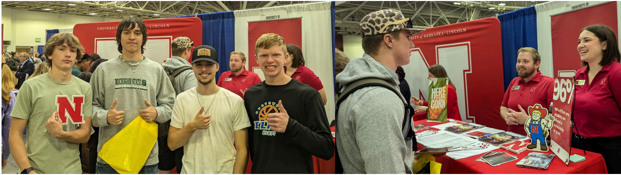
2025 Middle School Job Shadow Experience- 8th Graders