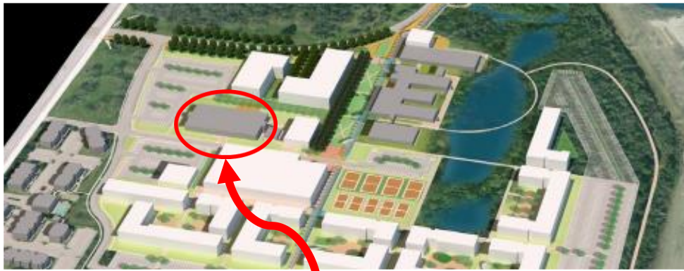
Delta Building Renovation

Shaded: Existing buildings Light: Future buildings