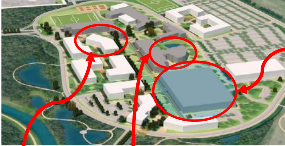
STEM II Future