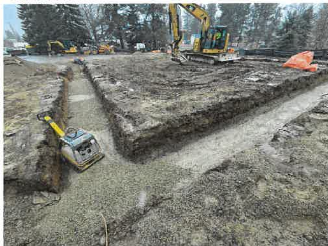
Prepping for Footings & Foundation Walls