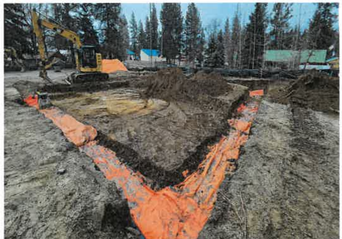
Prepping for Footings & Foundation Walls